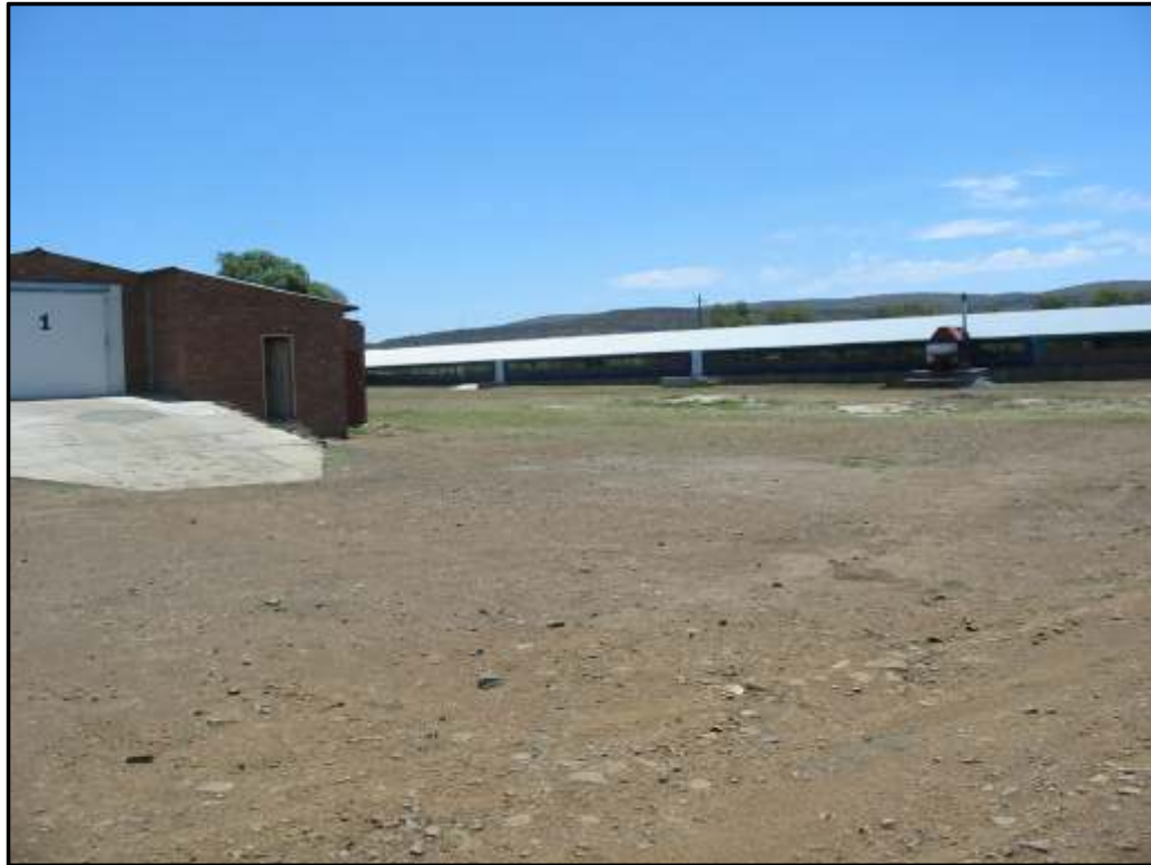
Figure 1: General Site Conditions

No heritage significant sites are located within the study area. The area is extensively disturbed by agricultural activities and the proposed 2 boilers will be located next to the existing broilers.