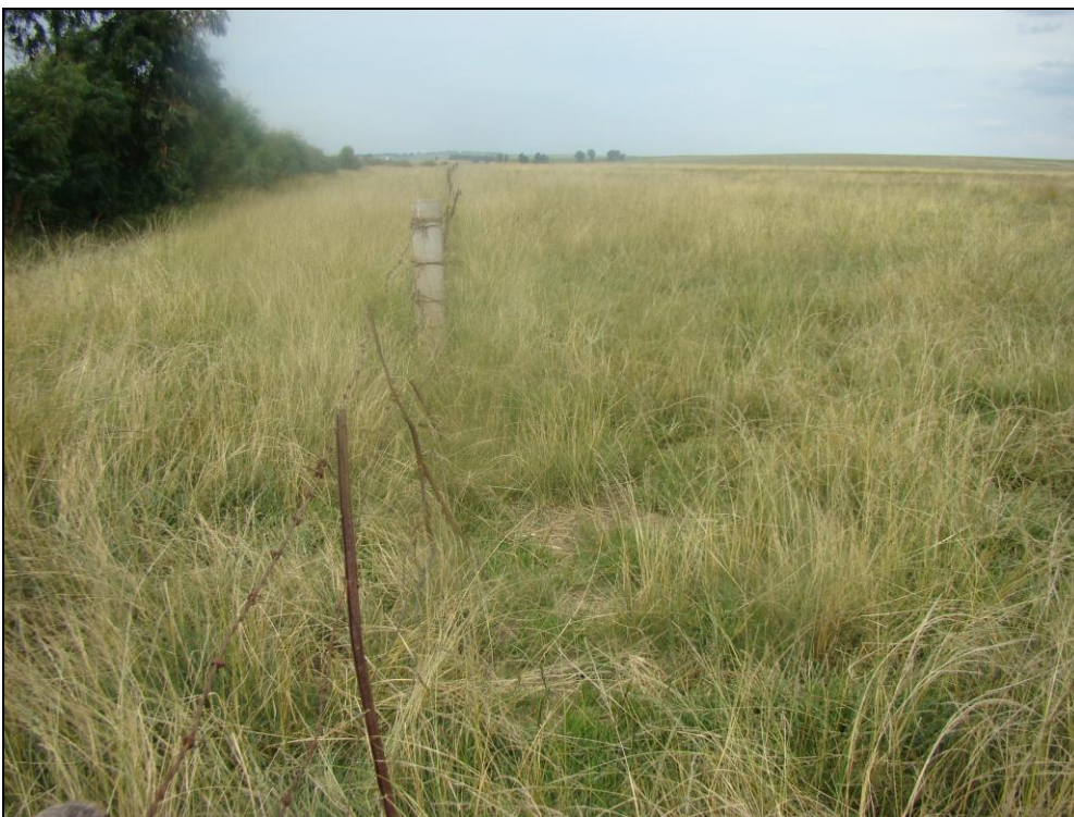
Fig.4 View from point C along the area of development facing east.