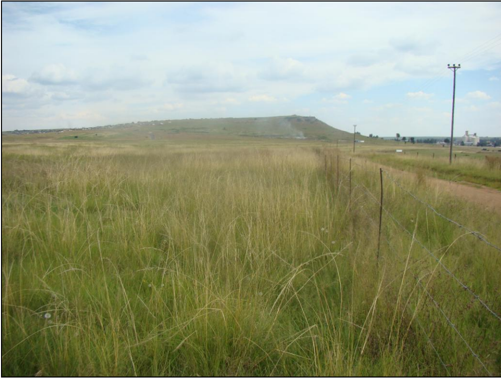
Fig.1 View across the proposed site of development at Point A facing south.