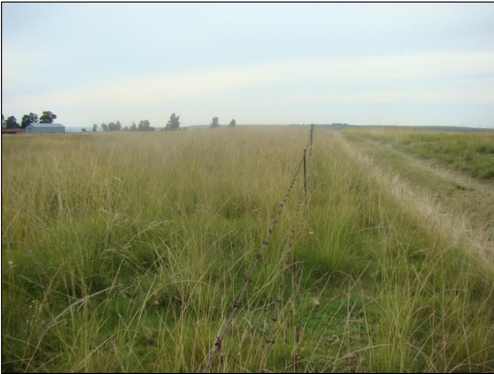
Fig.5 View from Point D.