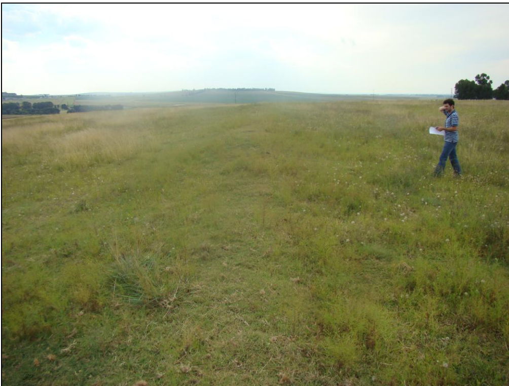
Fig.6 View from Point D facing east.