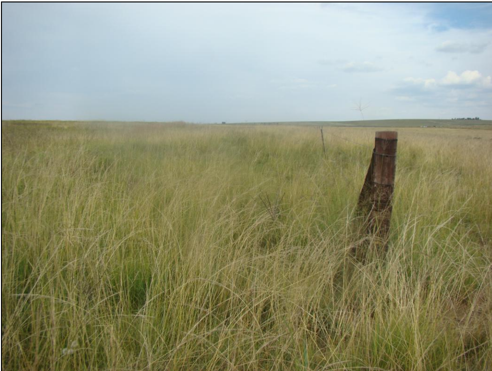
Fig.3 View from Point B facing north.