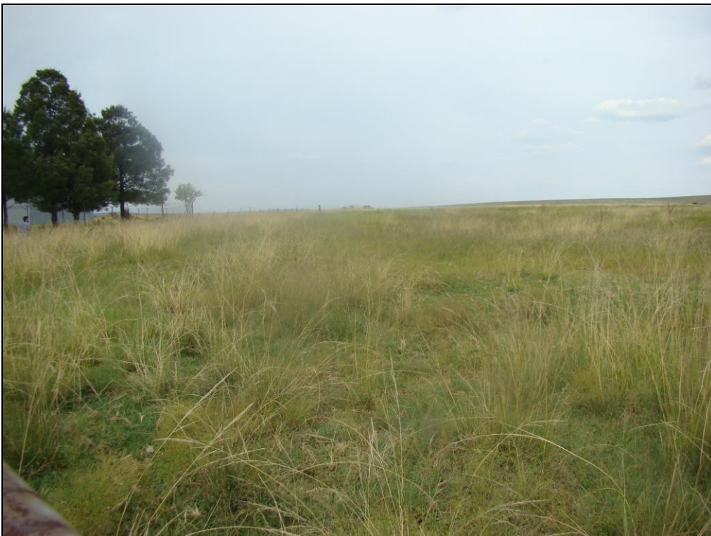
Fig.2 View across the proposed site of development at Point A facing east.