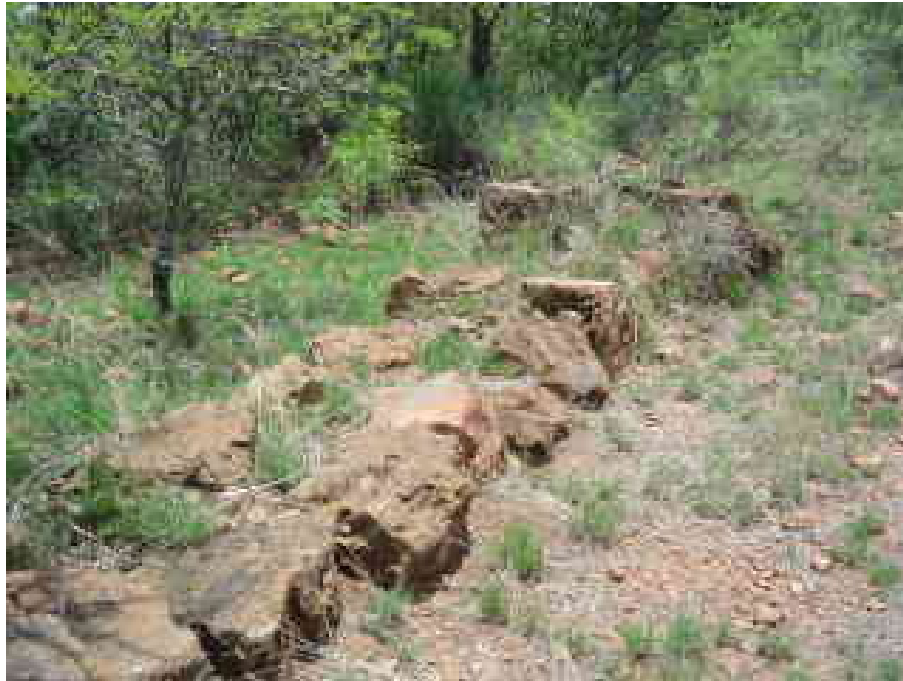
No. 6 Remains of two parallel rows of stones on the Northern Site