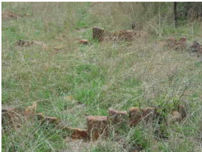
No. 3 Remains of a house