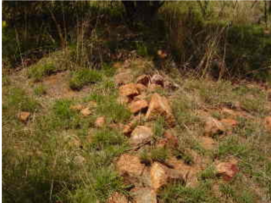
No. 4 Stonewalling on the out skirts of the main settlement where the commoners lived