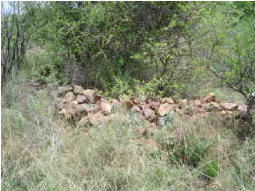
No. 5 Low stonewalling typical of the Western site