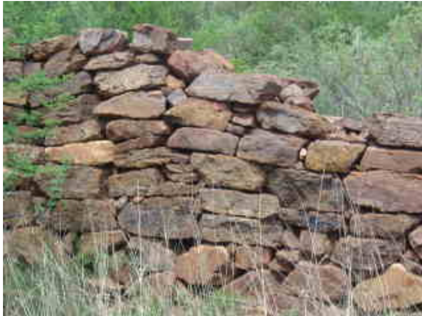
No. 2 Detail of well built stonewall