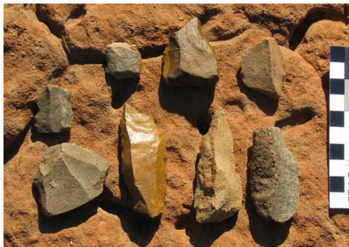
Probably Middle Stone Age artifacts, nearer the road at 29°23'33.8" S 23°18'41.8" E