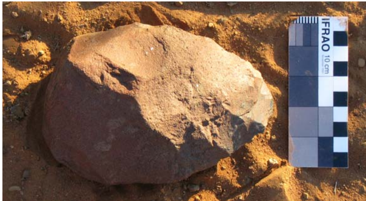
Handaxe at 29°23'34.3" S 23°18'23.4" E (above) and Victoria West core at 29°23'30.9" S 23°18'34.6" E (below)

No finds during the extended survey contradicted the conclusions from the June 2010 survey.