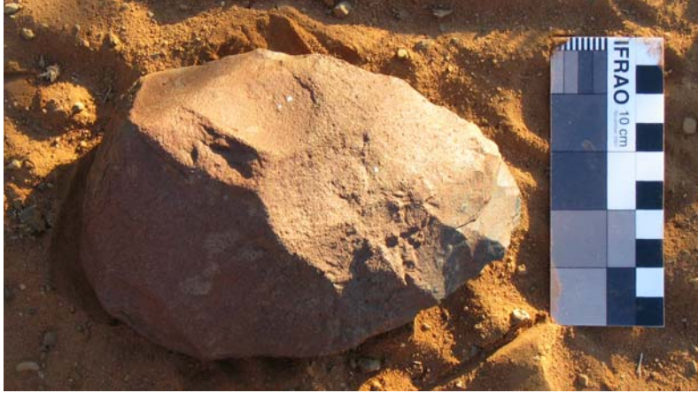
Handaxe at 29^{\circ}23'34.3'' S 23^{\circ}18'23.4'' E (above) and Victoria West core at 29^{\circ}23'30.9'' S 23^{\circ}18'34.6'' E (below)