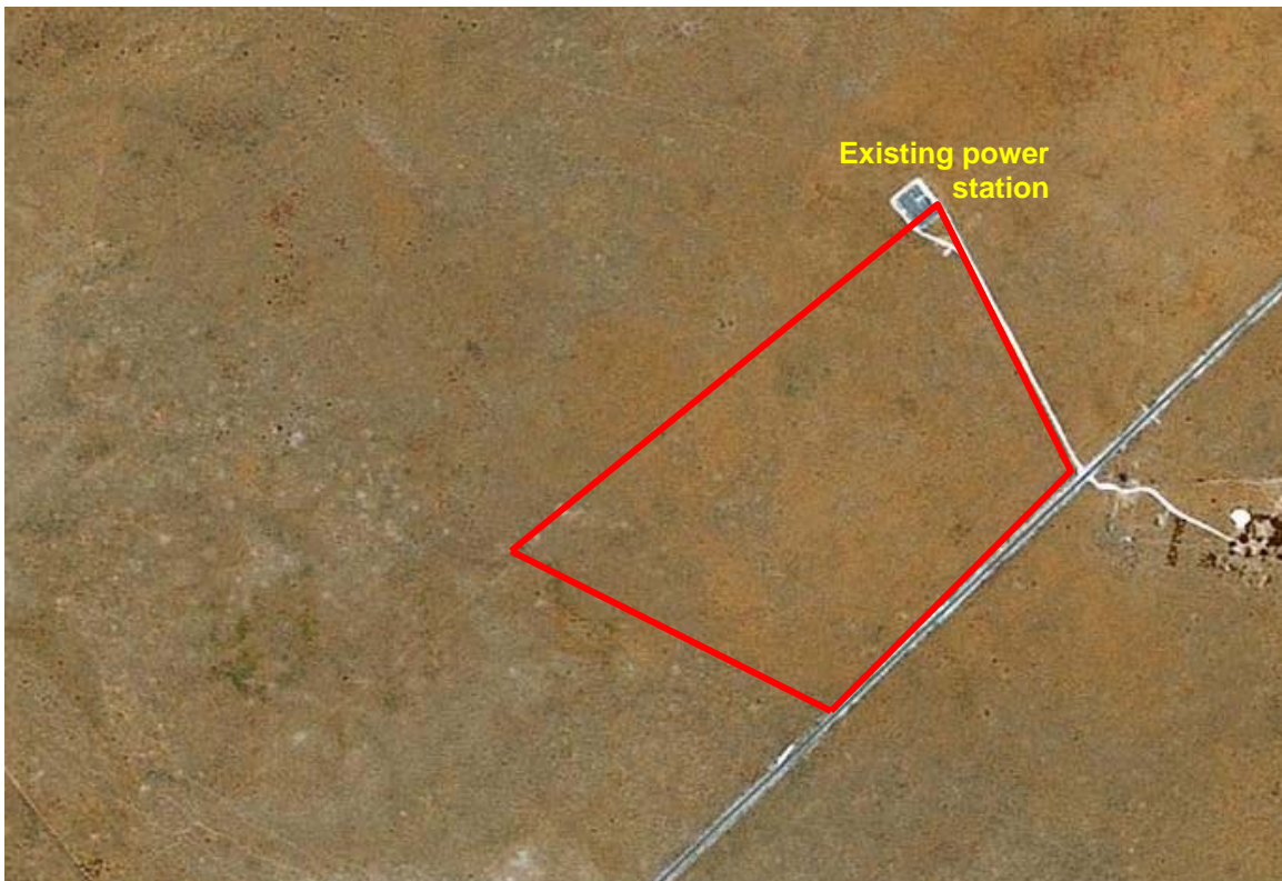
Google Earth image showing the area examined for the proposed power station development (outlined in red). The location is situated on 1:50 000 sheet 2923AD.

No traces dating from the colonial era were noted.