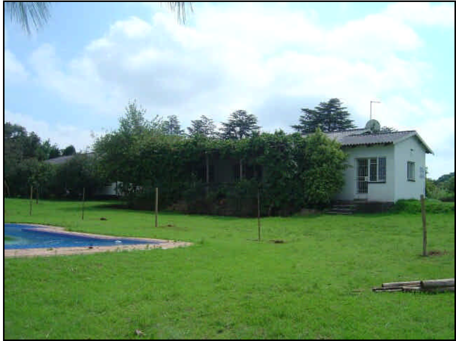
•Figure 2: Modern dwellings on site