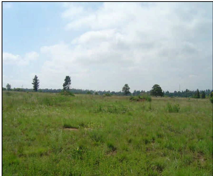
• Figure 1: General site conditions

The area is to large part impacted on by agricultural activity in the past. There are three structures on site and according to Mr. Stolze these structures date from the seventies. Maps of 1944 and 1959 indicate no structures in the area and thus none of the current structures are older than 60 years or of any heritage significance. However during public consultation a Mr. George Stolze indicated that he is water diviner and that he can see several sub surface graves on the property. No indication of any graves could be seen on the surface.