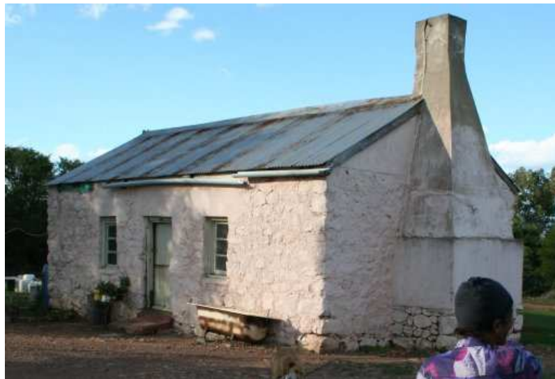
Fig. 6. Site 5, stone house in traditional style that is part of the farmyard