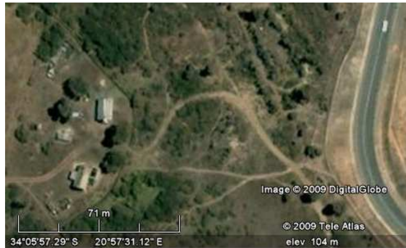
Fig. 5. Aerial view of the two structures forming a small farmyard (werf) on Site 5.