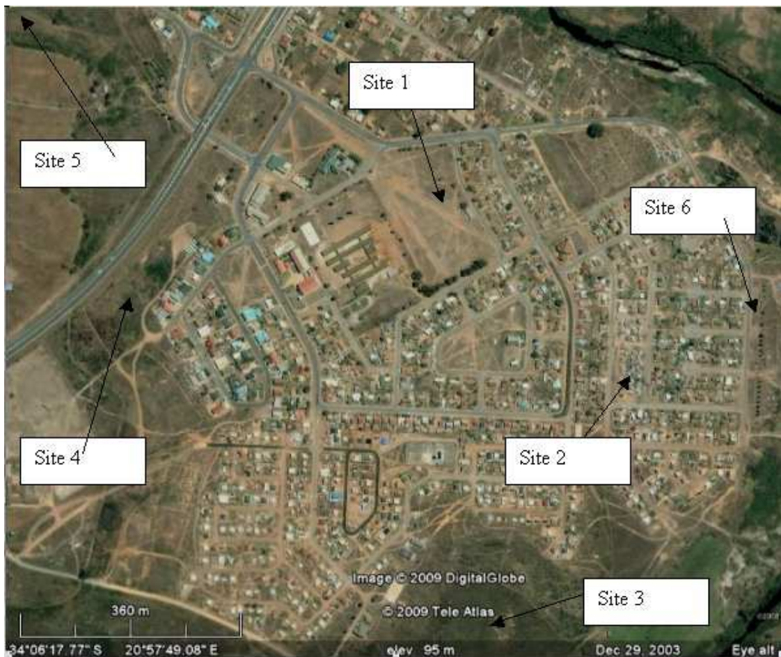
Fig. 3. Aerial view of the sites in relation to the urban development of Heidelberg

All the sites are south of the N2 except Site 5 and all are within the urban edge of the town. These are the infilling of areas available for housing development.