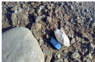
Fig. 4. Acheulian artefact on Site 3

Features like human burials can occur in unpredictable locations. It is recommended that should any excavations by chance uncover buried palaeontological or archaeological materials including human remains that Heritage Western Cape is notified (Mr N Wiltshire, Heritage Resource Management Services, HWC, Private Bag X9067, Cape Town 8000, Tel:021 483 9743, Fax:021 483 9842, nwiltshire@pgwc.gov.za ).