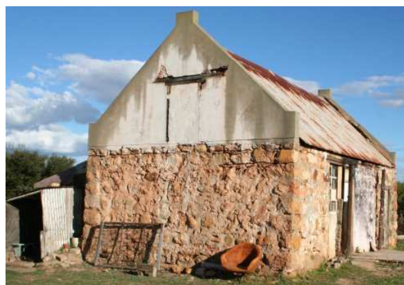
Fig. 7. Site 5, stone horse stable (perdestal) needs some attention to the structure.