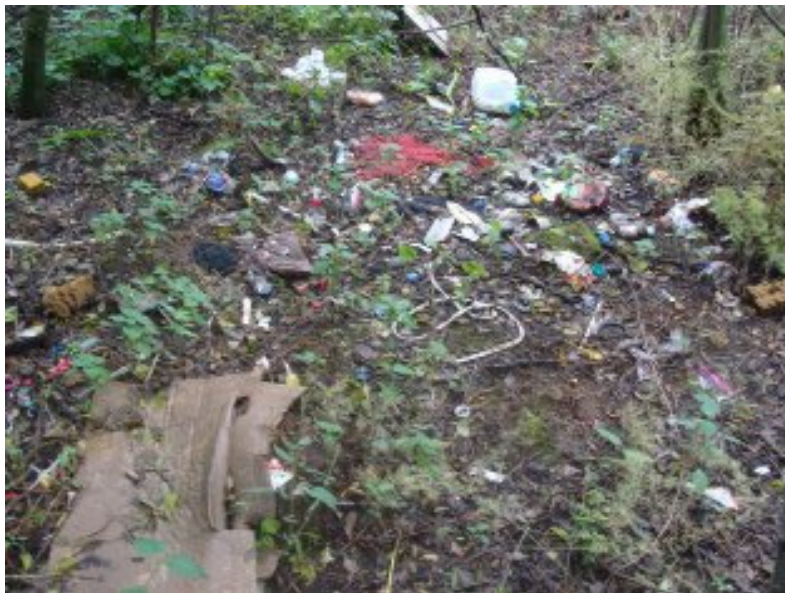
Figure 5: Illegal dumping taking place in the area.