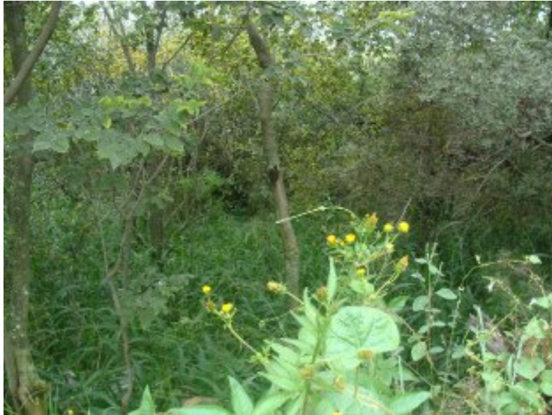
Figure 4: Dense vegetation made visibility difficult.