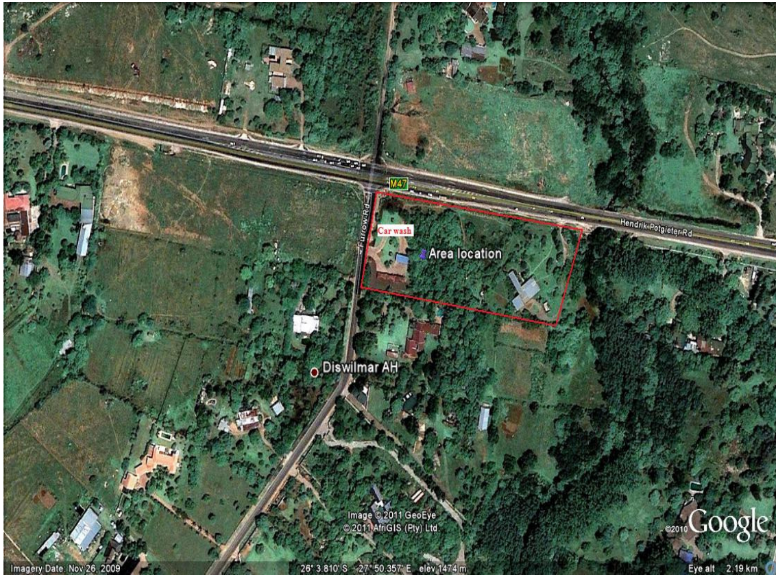
Figure 2: Aerial view of development location (Google Earth 2011).