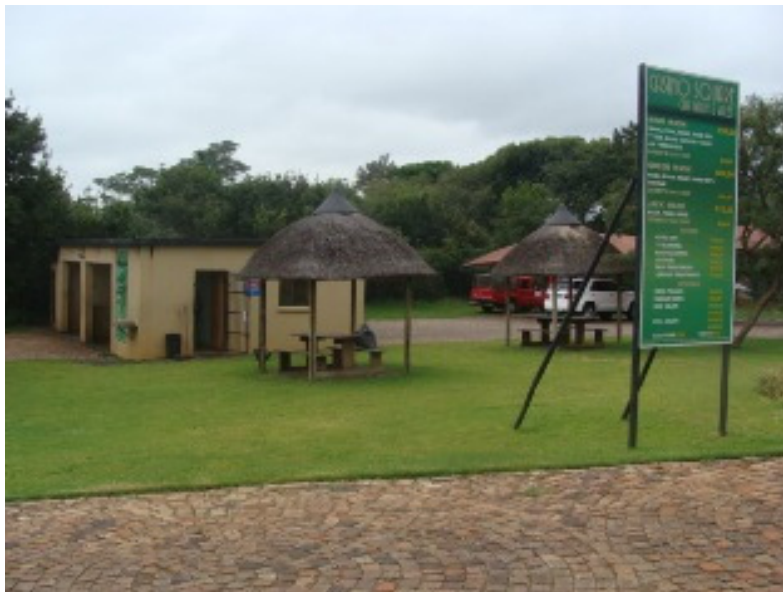
Figure 3: A view of the car wash that forms part of the property.