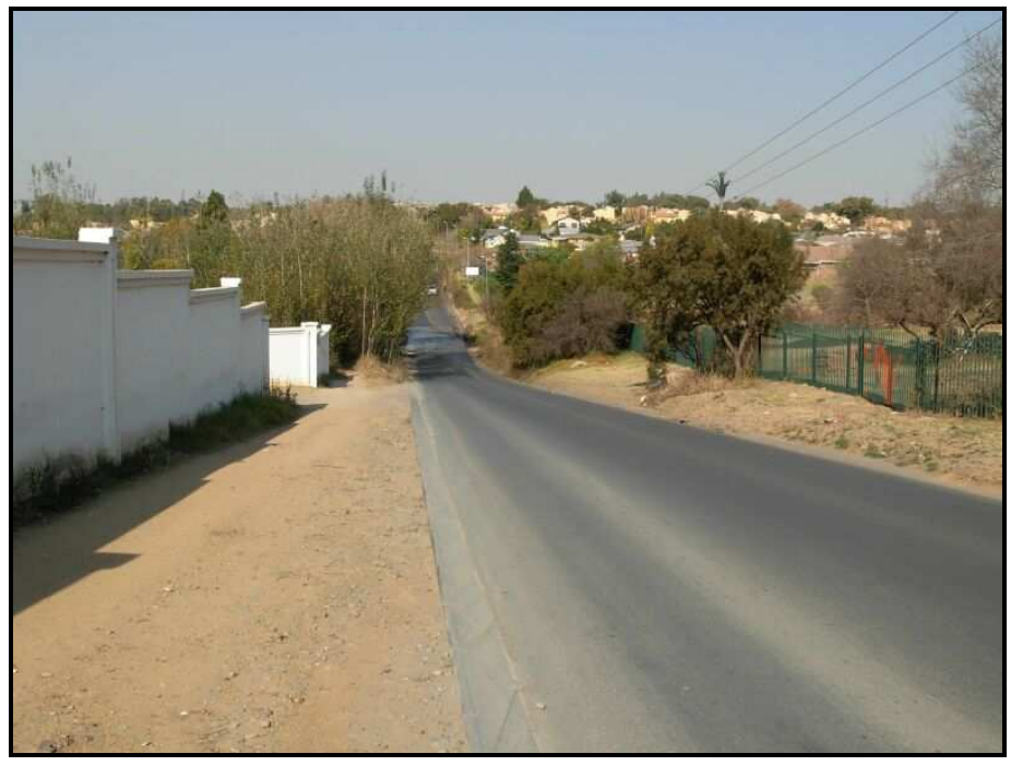
Figure 2: View of low level bridge access from north