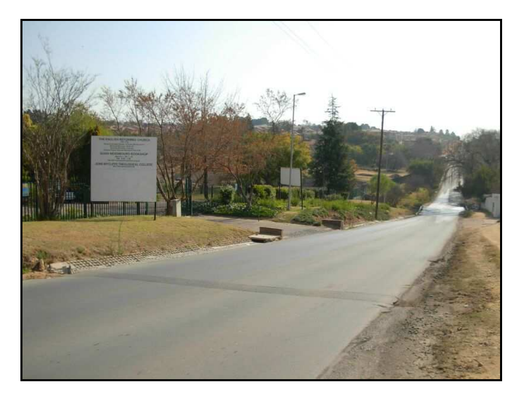
Figure 4: View of low level bridge access from south