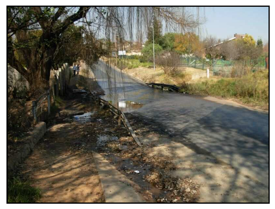
Figure 3: View of low level bridge