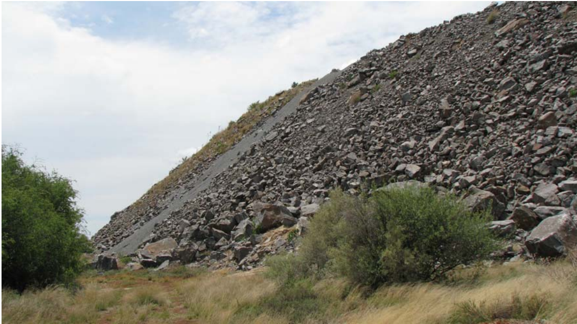
The dump north west of the present mine pit at the northern end of the study area. A dump such as this covered a small engraving site recorded by the McGregor Museum in 1994 (Morris & Beaumont 1994)...