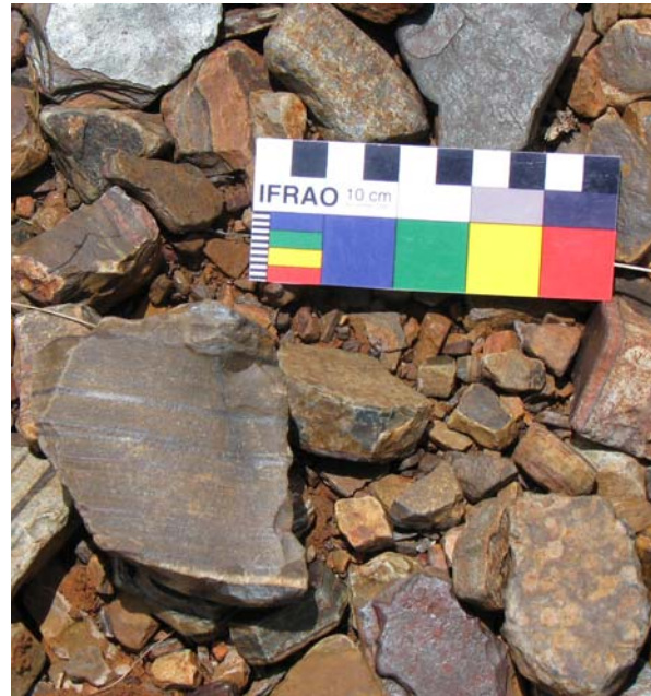
Very occasional flaked chert (in the dolomite exposure area, left) and banded ironstone (right) was noted – but in no instances were concentrations even as much as 1 per square metre.