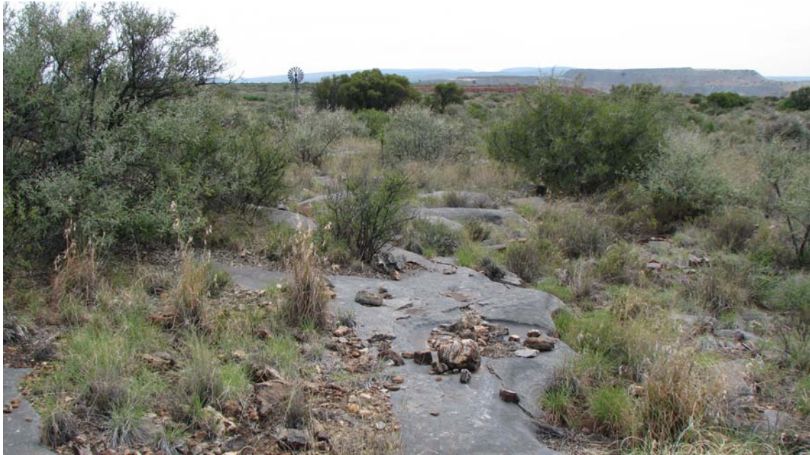
Dolomite 'bank' on hillslope, facing north, with mine dumps in the background.