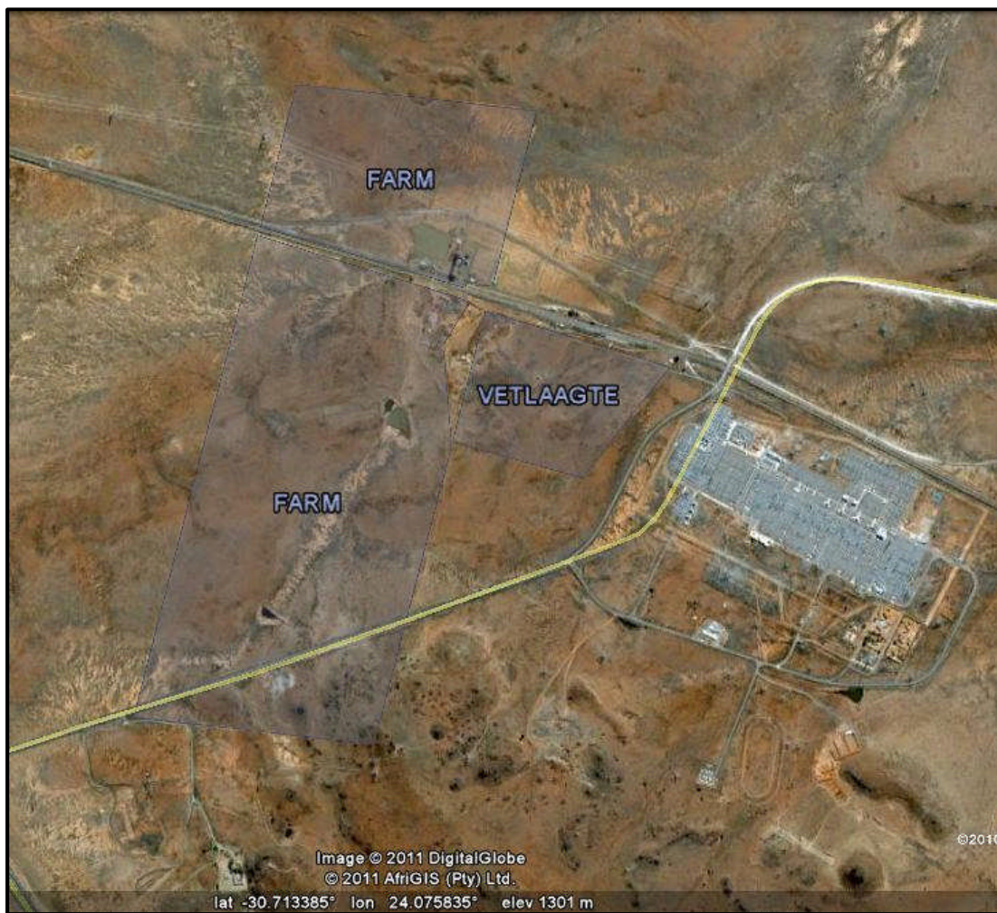
Fig. 2. Aerial view of the site.