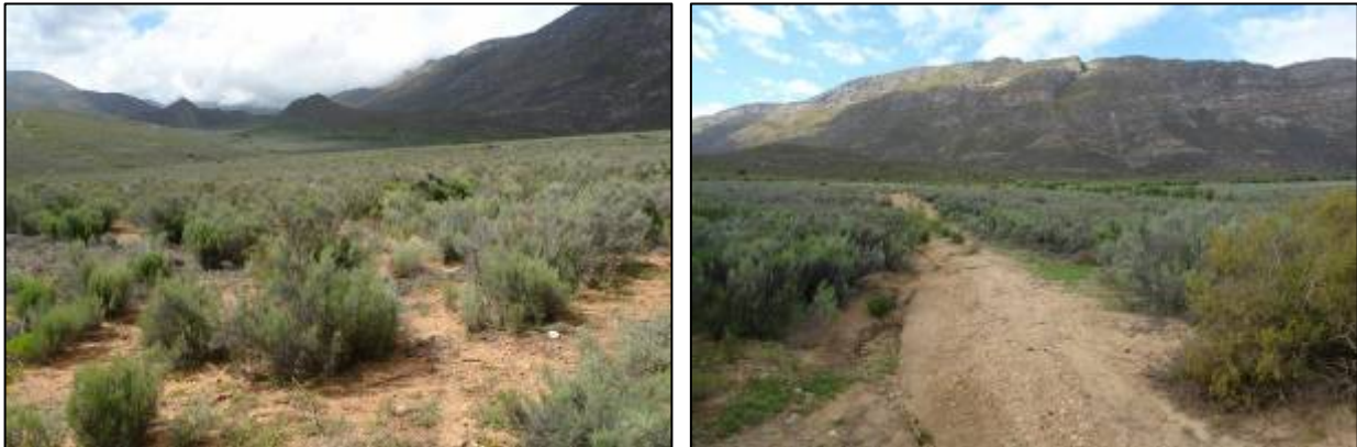
Figs 5-16. Different views of Site 2 for the proposed extension and upgrading of the Barrydale wastewater treatment works

dense renosterbos veld and disturbed by general farming activities and vehicle tracks (Figs 5-6). No archaeological sites/materials were observed and it would appear unlikely that any will be exposed during the development. There are no buildings or graves older than 60 years.