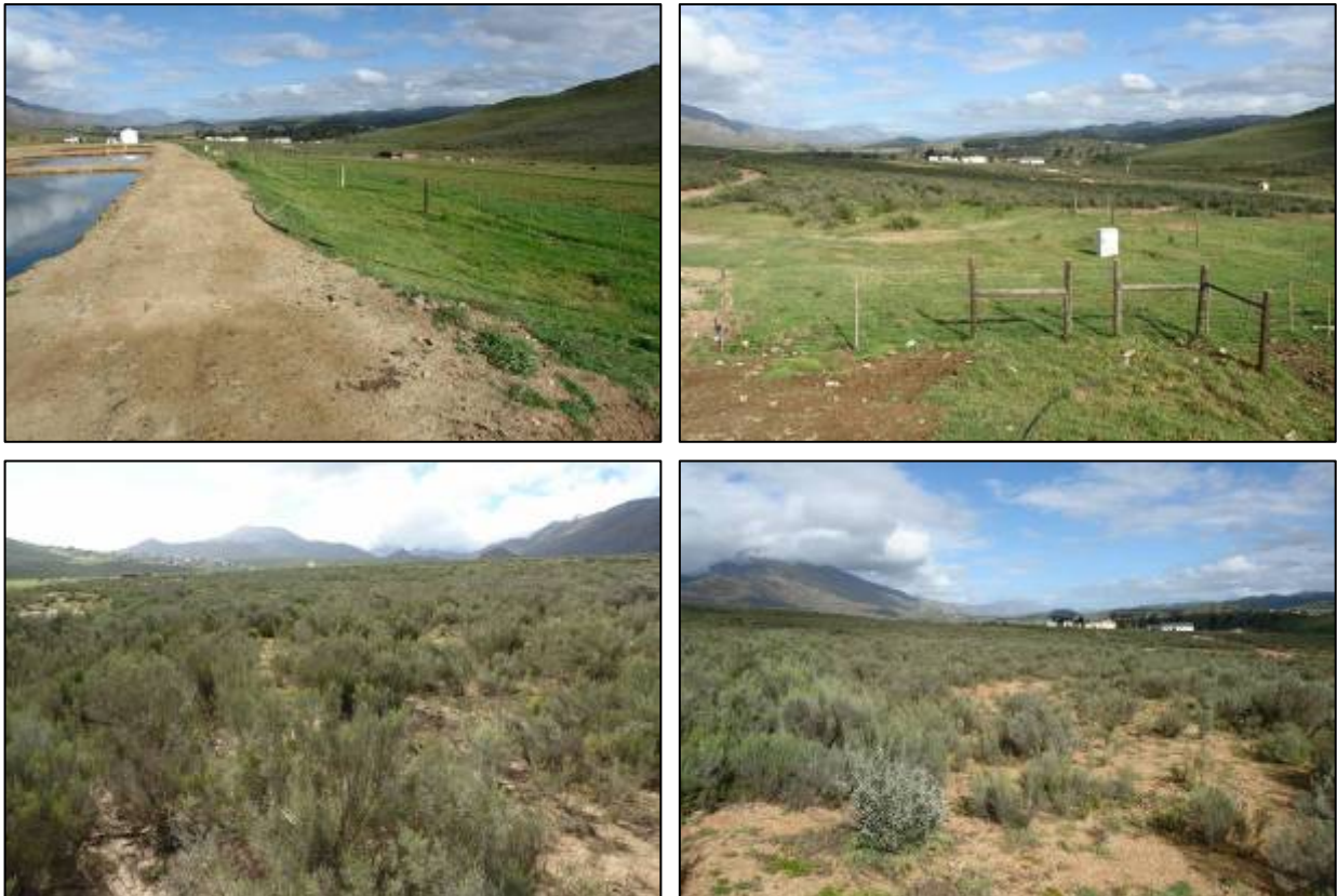
Figs 1-4. Different views of Site 1 for the proposed extension and upgrading of the Barrydale wastewater treatment works; general views from the existing ponds of the surrounding landscape (top row), views of the site towards the north (bottom left) and towards the south (bottom right).

One of the proposed sites for the extension and upgrading of the Barrydale wastewater treatment works, Site 1, is situated next (west) to the existing waste water treatment works approximately 500 metres west of the Smitville residential area and the same distance from the industrial area (GPS reading at the waste water treatment works: 33.55.1,50S; 20.43.14,91E ) (Maps 1-2). The proposed site has a gentle slope towards a small drainage line (north) and is located on previously ploughed fields and is therefore severely disturbed. Furthermore, the area is covered by dense renosterbos veld and several vehicle tracks also disturbed the site (Figs 1-4). No archaeological sites/materials were observed and it would appear unlikely that any will be exposed during the development. There are no buildings or graves older than 60 years.