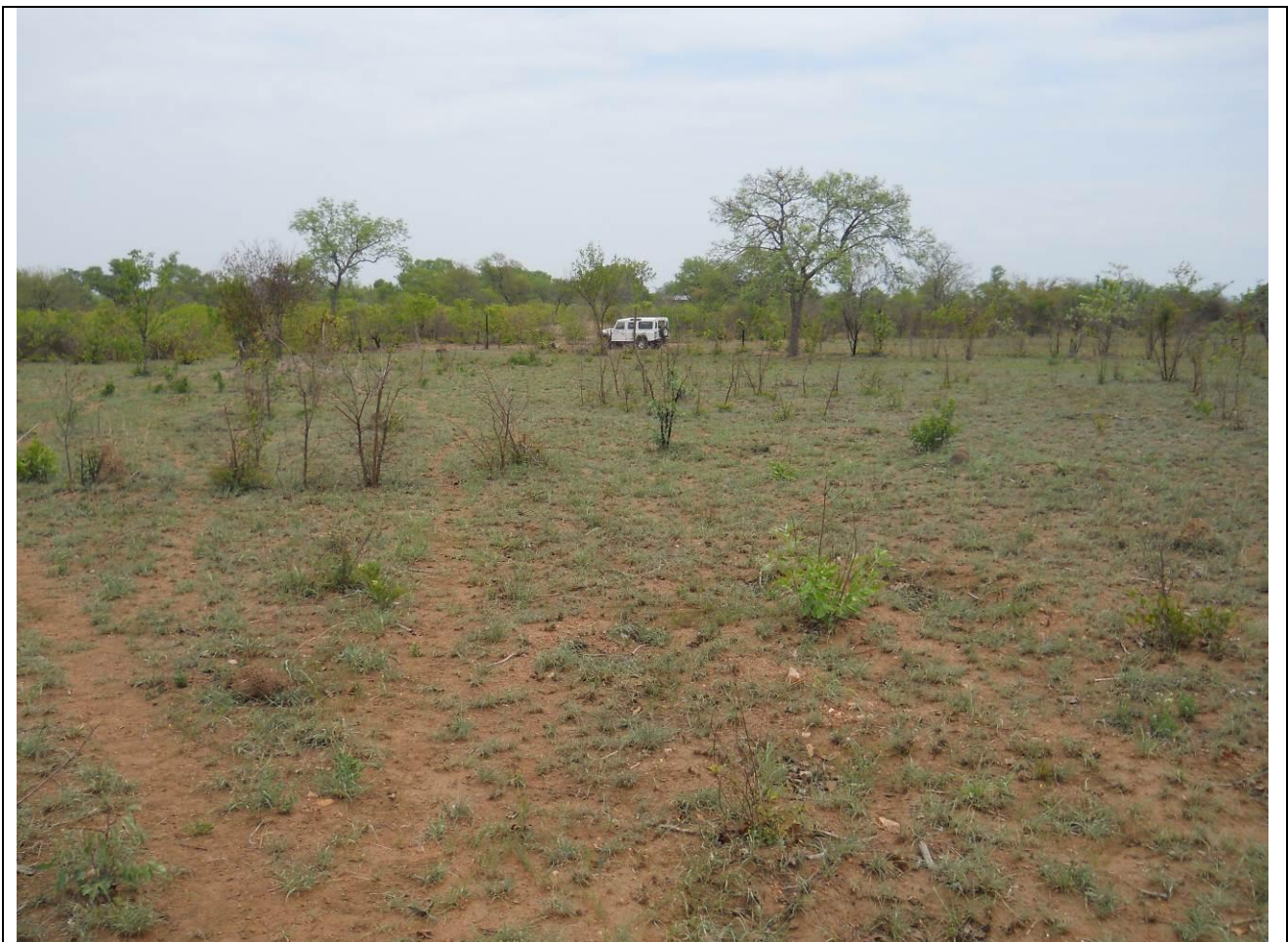
Fig 1. General view of the terrain. Note deforestation.