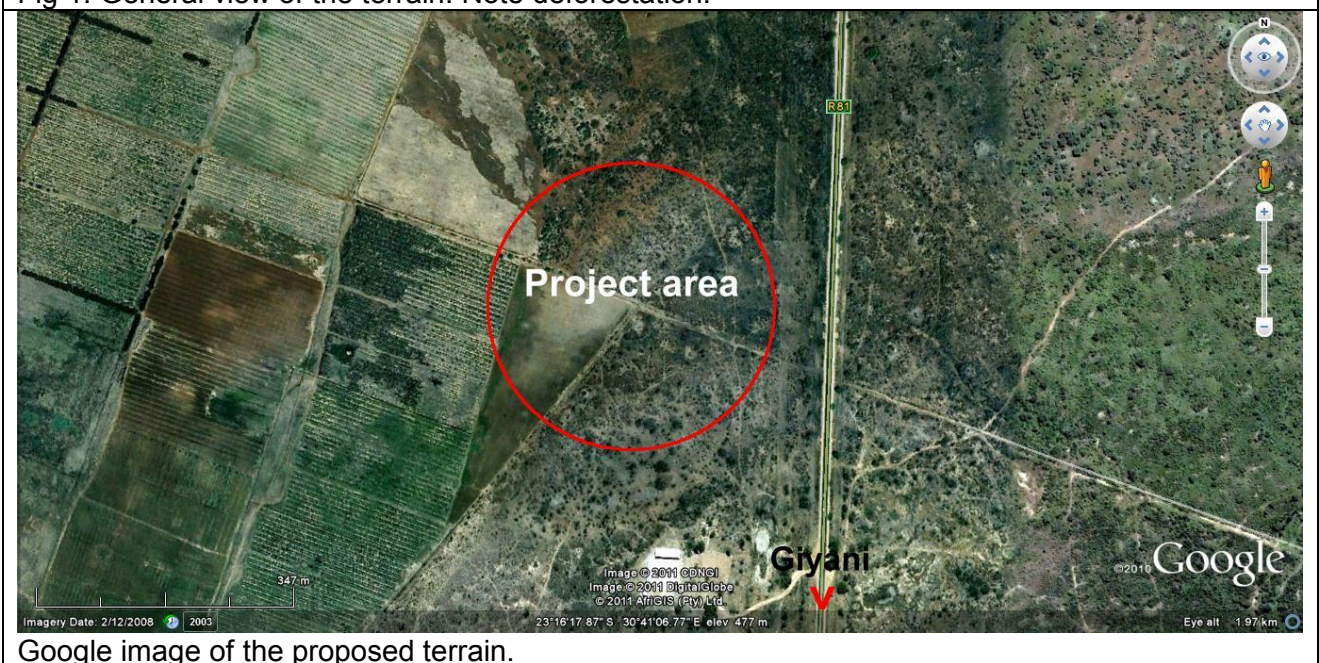
Google image of the proposed terrain.