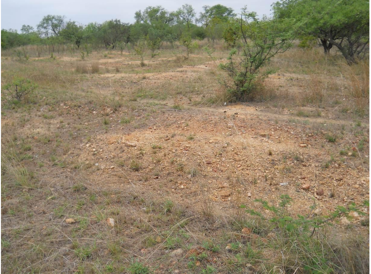
Fig 2. General view of terrain – note removal of topsoil.