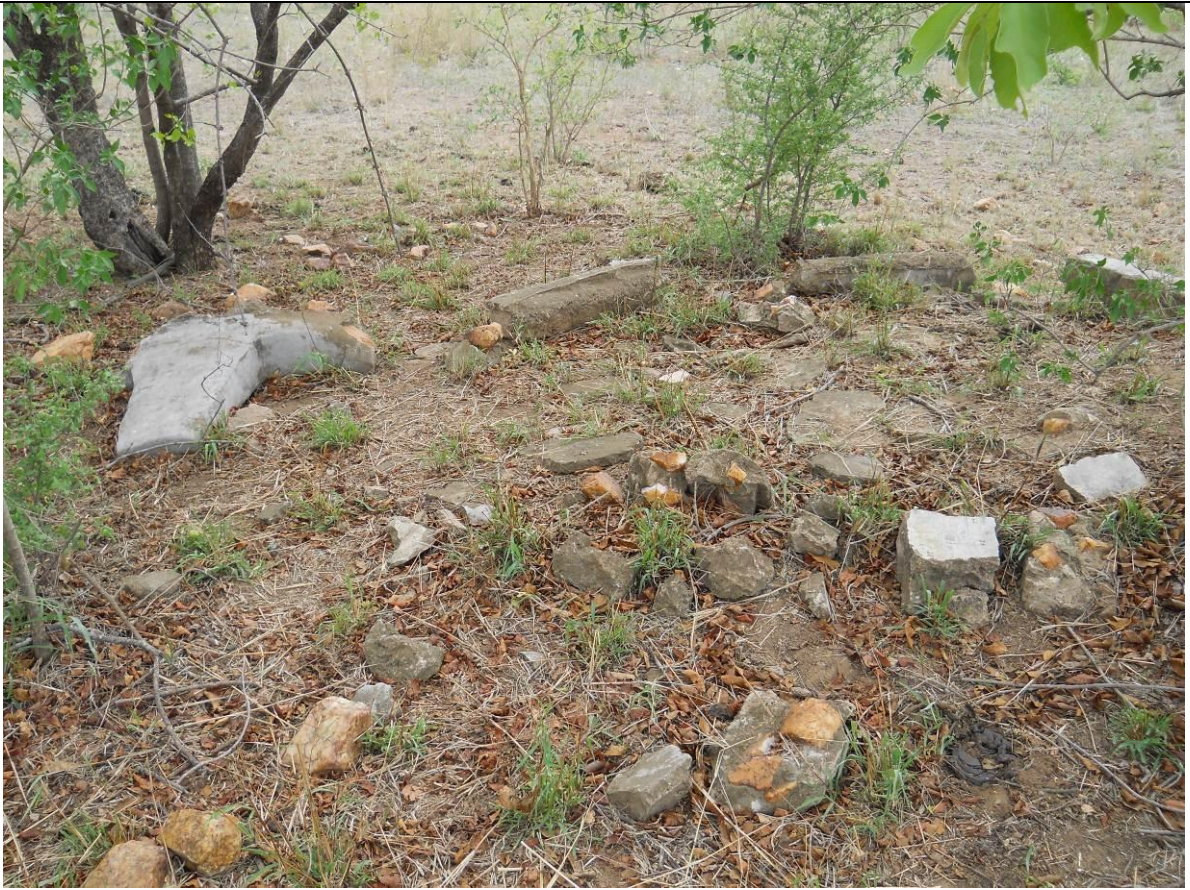
Fig. 1. The possible grave. Note broken up concrete slab and blocks.