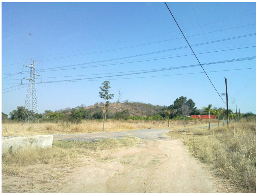
Figure 5. Dirt roads