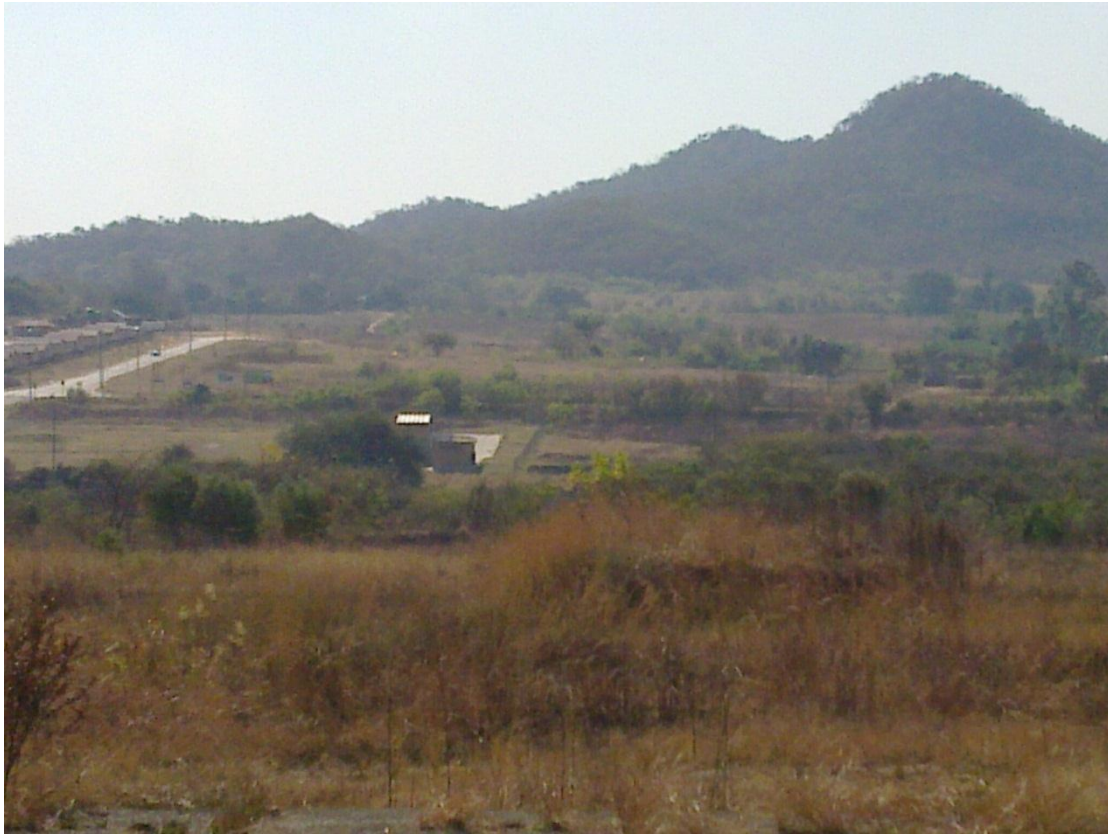
Figure 1: Photo indicating landscape type