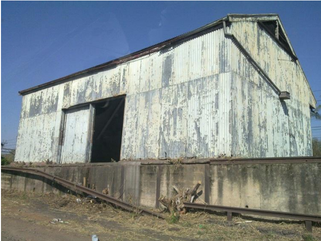
Figure 3. Possible historic sheds