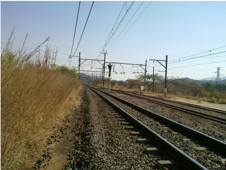
Figure 4: Railway platforms