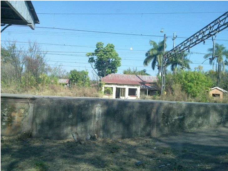
Figure 2: Residential Buildings