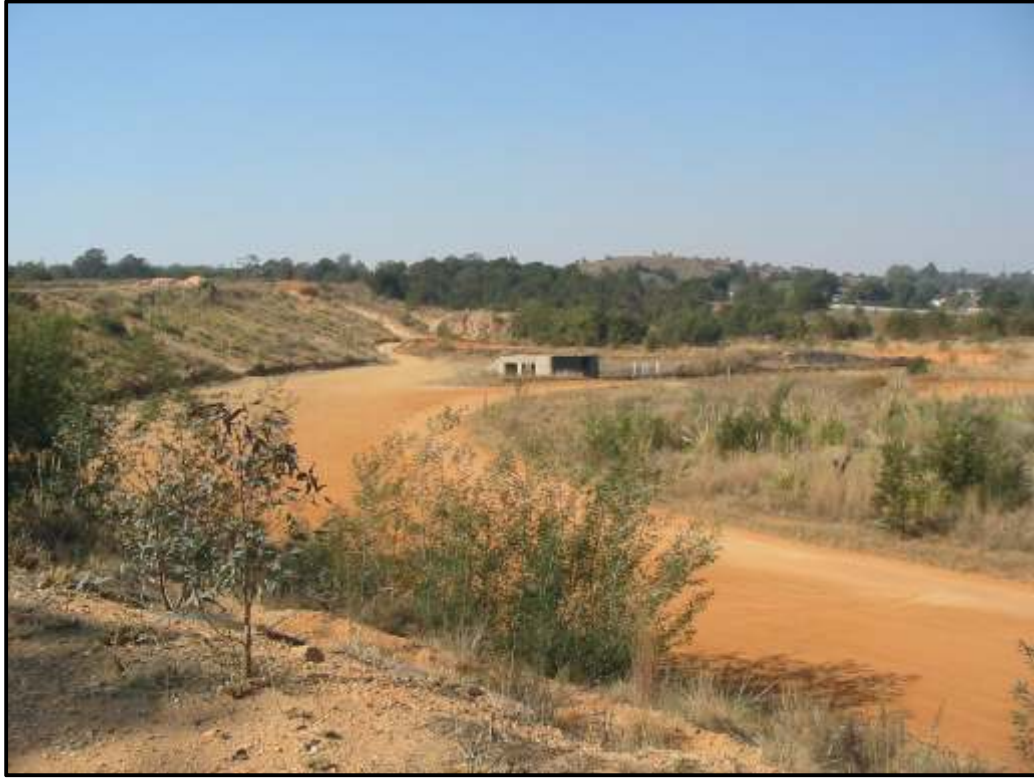
Figure 3: General site conditions