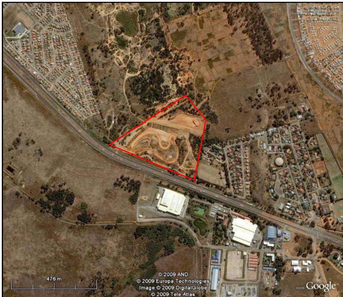
Figure 2: Aerial view of the study area. Note the disturbed character of the site

The study area is highly disturbed by extensive ground moving activities that would have destroyed any traces of heritage sites. Currently the site is used as a racing track and no sites of heritage significance could be located during the survey.