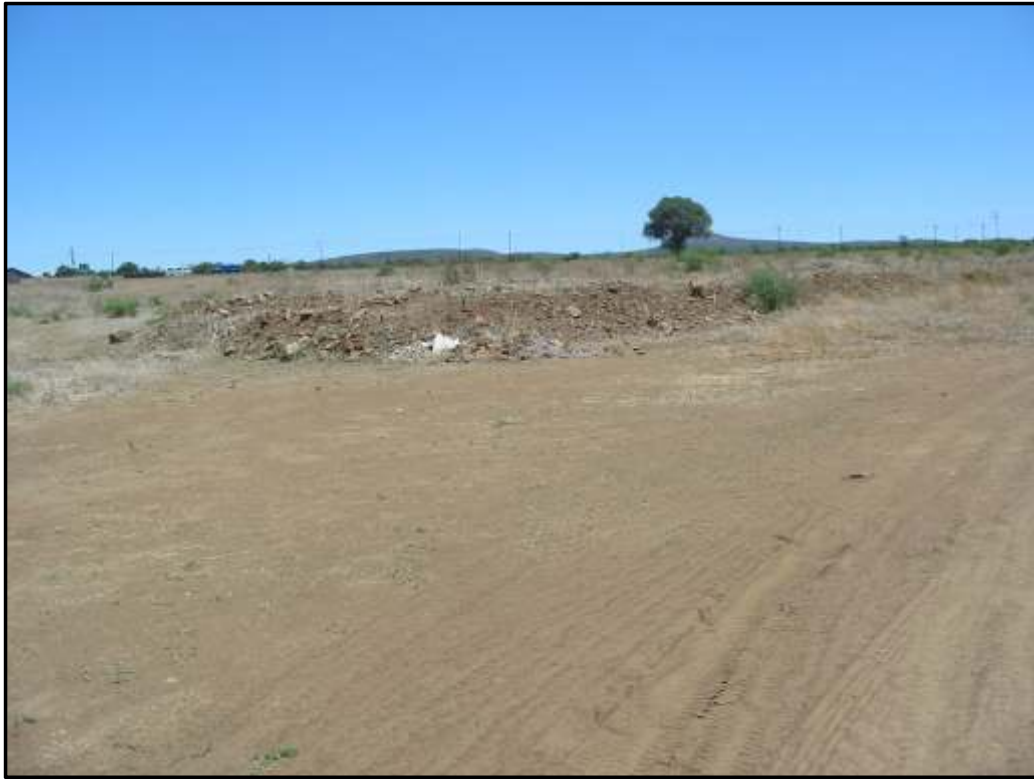
Figure 1: General Site Conditions

No heritage significant sites are located within the study area. The area is extensively disturbed by agricultural activities and the proposed boilers will be located in the old agricultural fields.