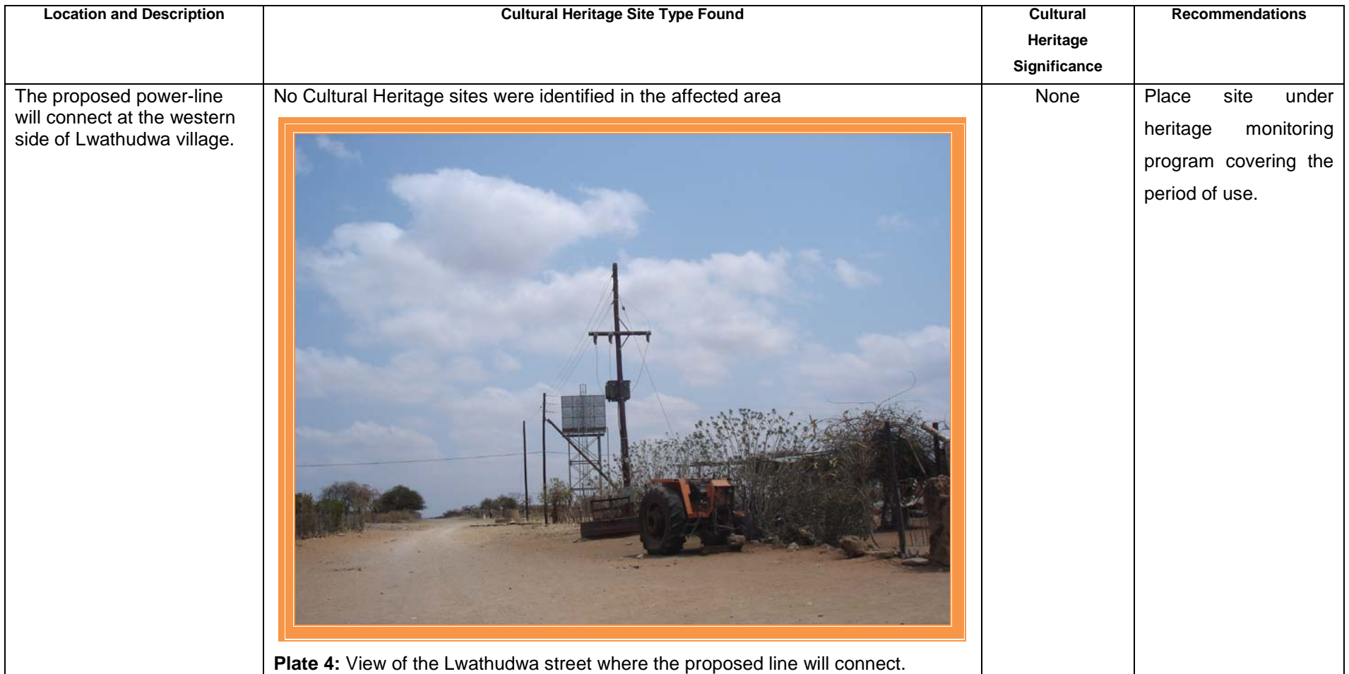
Plate 4: View of the Lwathudwa street where the proposed line will connect.