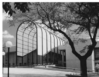
NATIONAL CULTURAL HISTORY MUSEUM NASIONALE KULTUURHISTORIESE MUSEUM

Date of survey: July 2003 Date of report: July 2003