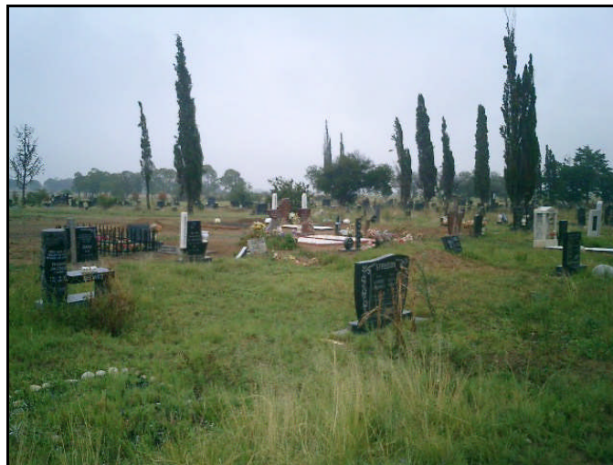
Figure 6: The formal contemporary graveyard, located on the neighbouring property