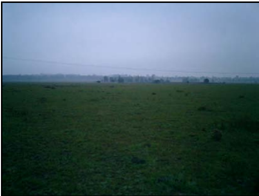
Figure 3: General view of the proposed development area towards Excelsior