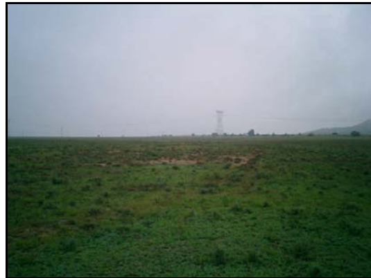
Figure 4: General view of the proposed development area towards the R703