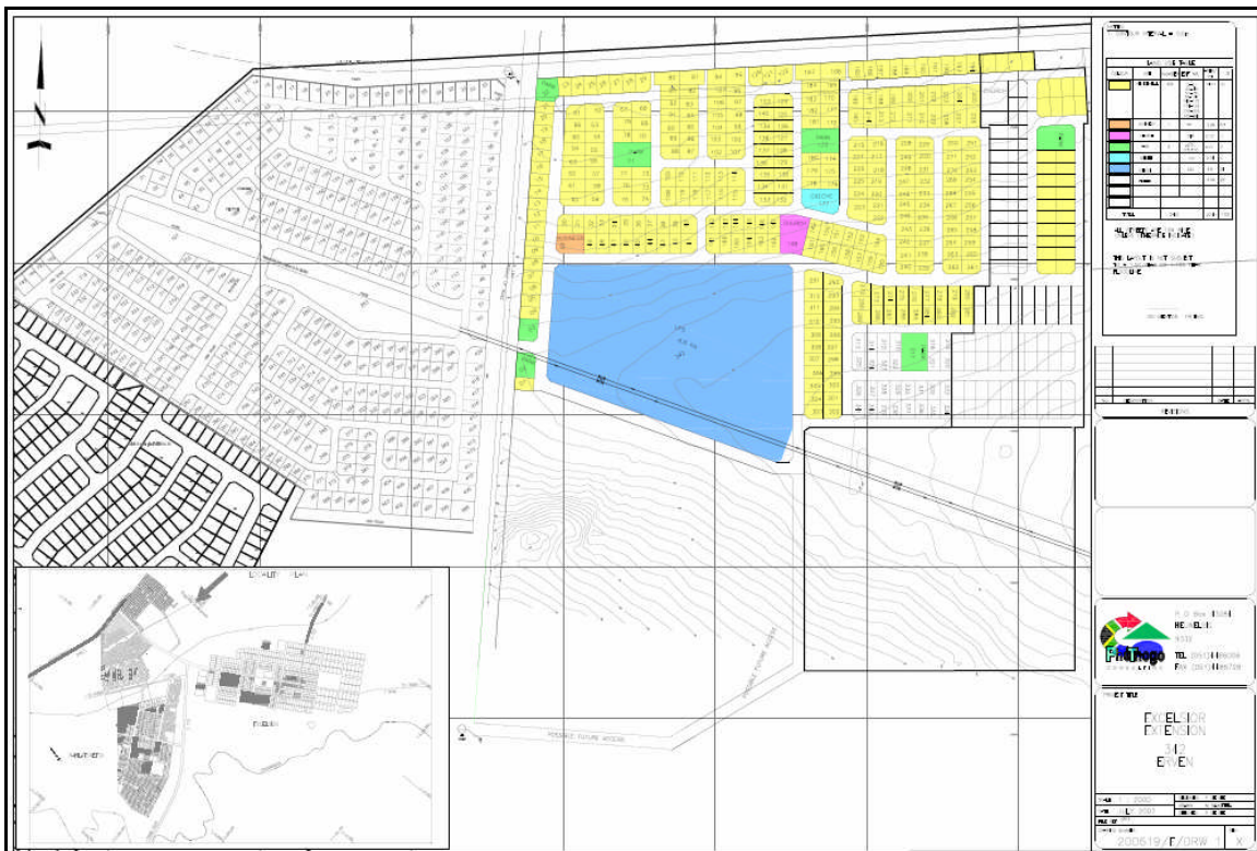
Figure 2: The new proposed approximate 17ha extension to the former proposal to be concentrated east and south-east of the former development area