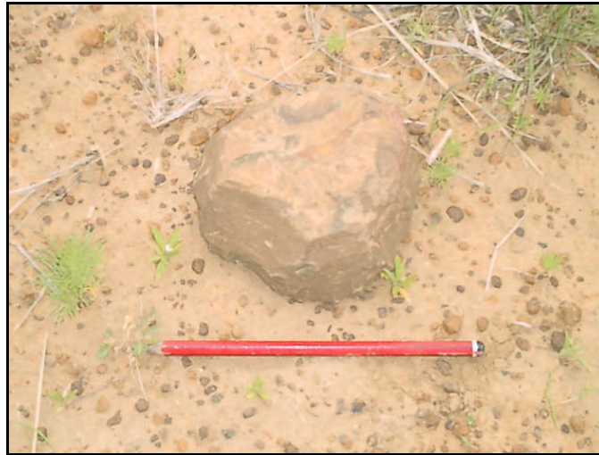
Figure 5: The Stone Age artefact discovered in a track on the assessment area

course of development without the developer having to comply with further archaeological and cultural heritage compliance requirements.