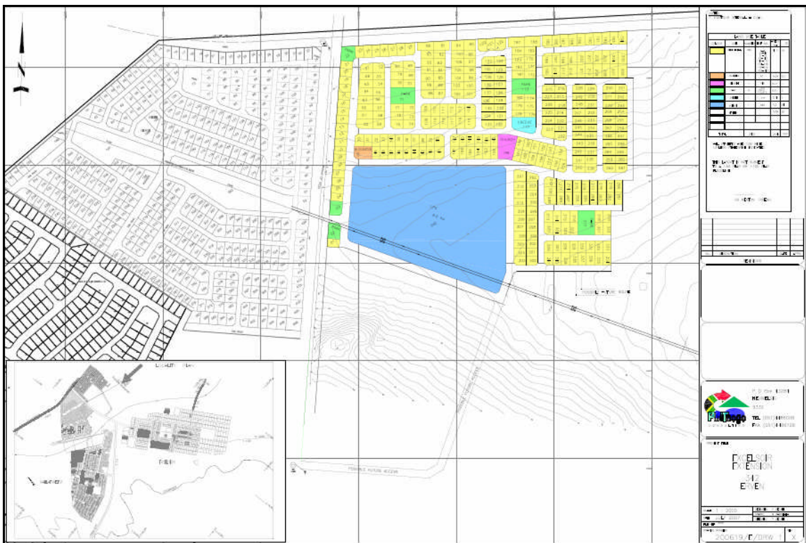
Figure 4: The development layout, Extension to Mahlatswetsa Township, Excelsior