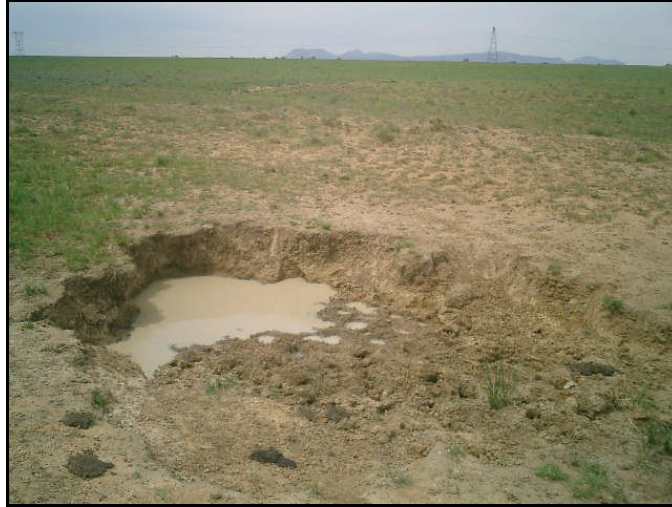
Figure 9: Erosion gully sections of approximately 30cm deep yielded no cultural stratigraphic layer