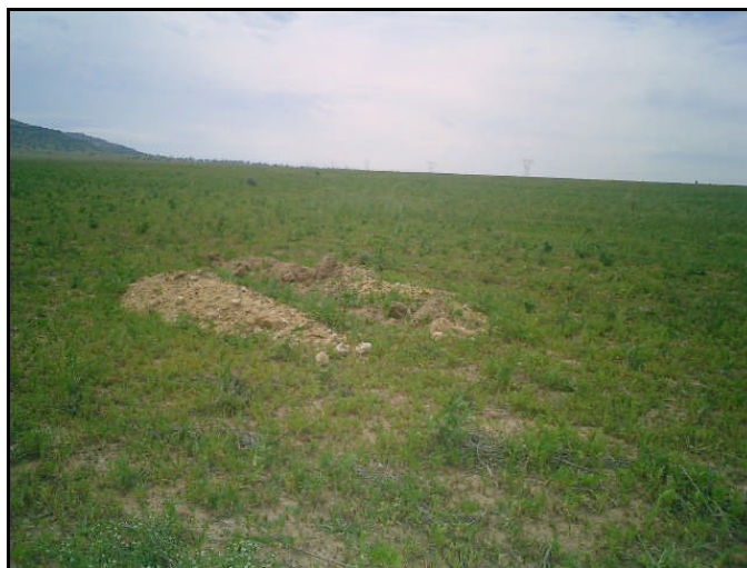
Figure 8: Limited shallow sub-surface exposures across the development area proved to be anthropically sterile