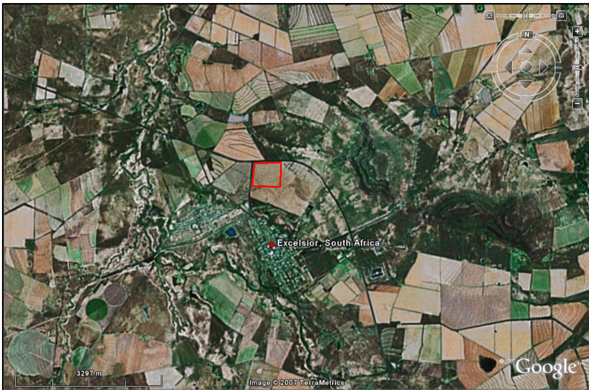
Figure 2: Location of the Extension to Mahlatswetsa Township development, Excelsior, Free State