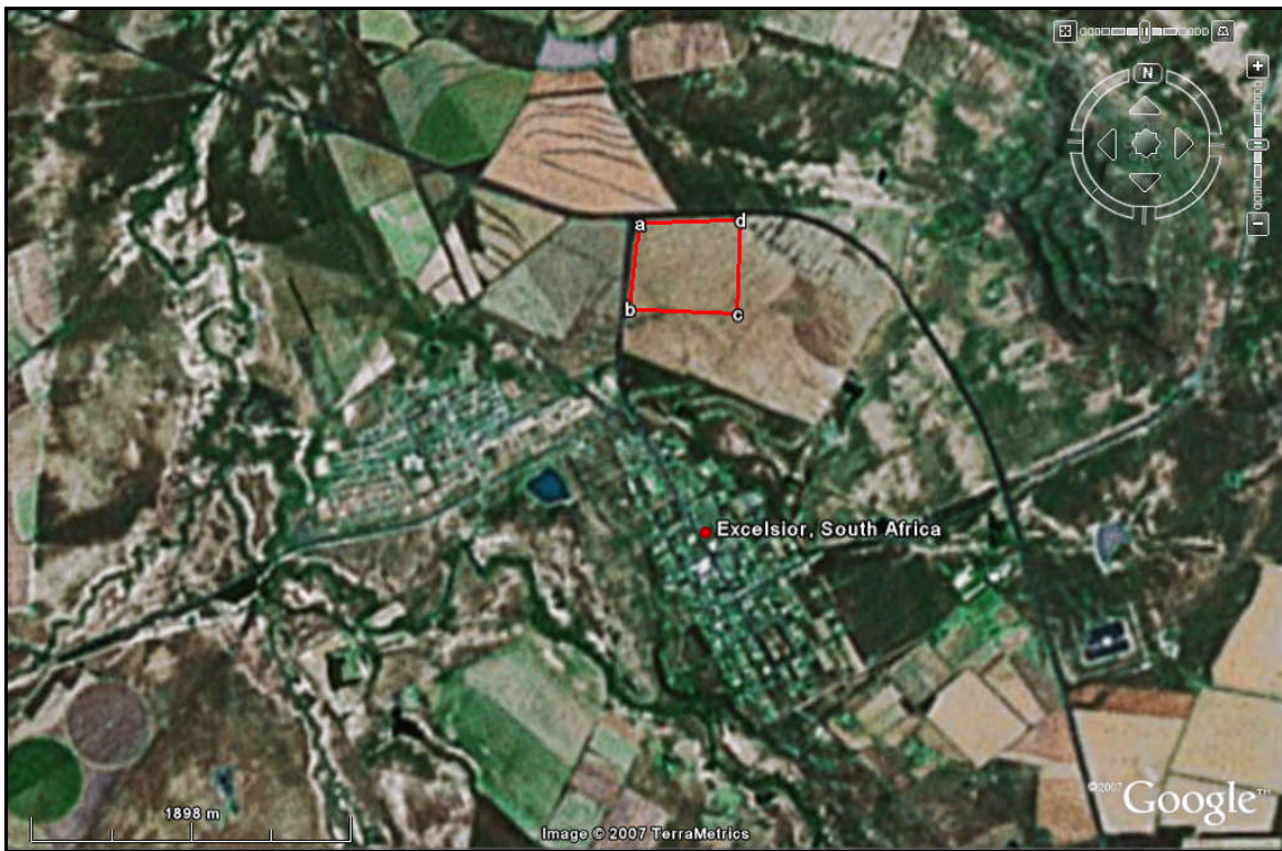
Figure 3: Close-up of the proposed Extension to Mahlatswetsa Township Development area, Excelsior