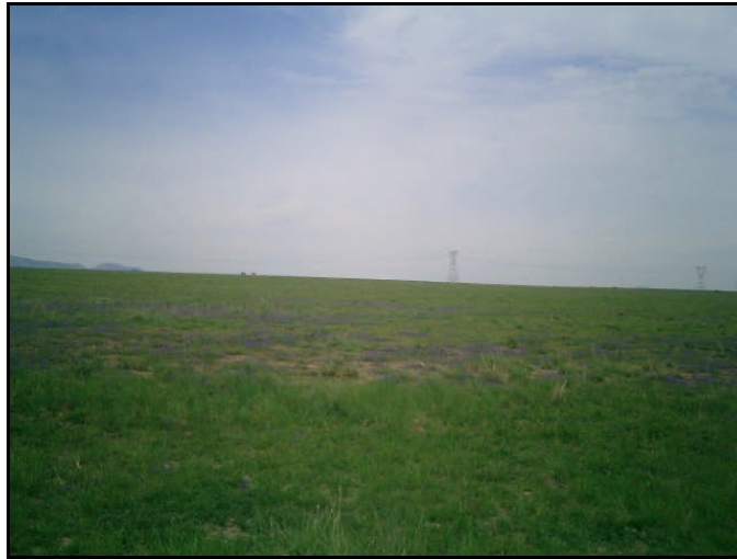
Figure 6: General view (towards the south) of the Extension to Mahlatswetsa Township development area