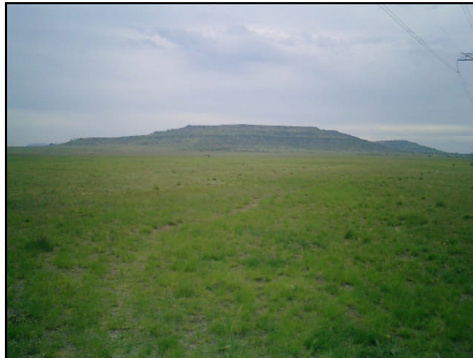
Figure 5: General view (towards the east) of the Extension to Mahlatswetsa Township development area, Excelsior, Free State

The proposed development area is bordered to the north by the R703 and to the west by the A167 and comprises exclusively of virgin land. Limited sub-surface exposures and a few shallow erosion gullies were present. Surface exposures and gully sections proved to be anthropically sterile to an approximate depth of 30cm below the present day surface.