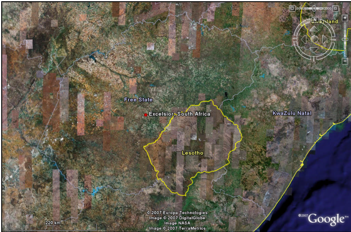
Figure 1: Excelsior, Free State, South Africa