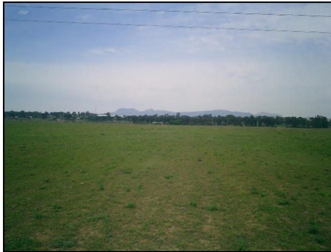
Figure 7: View from the southern part of the development area towards existing Excelsior development