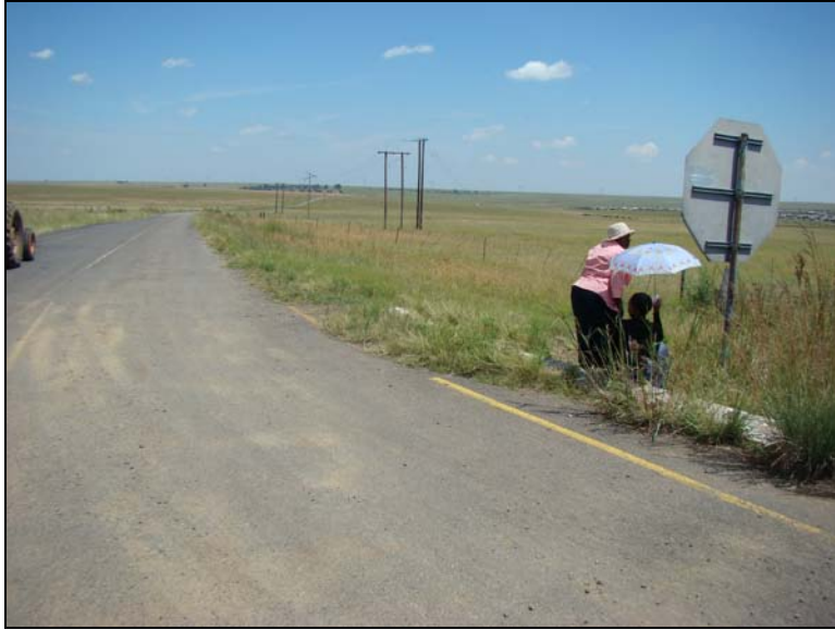
Fig.1 View from Point A along the S170 secondary road to the west.