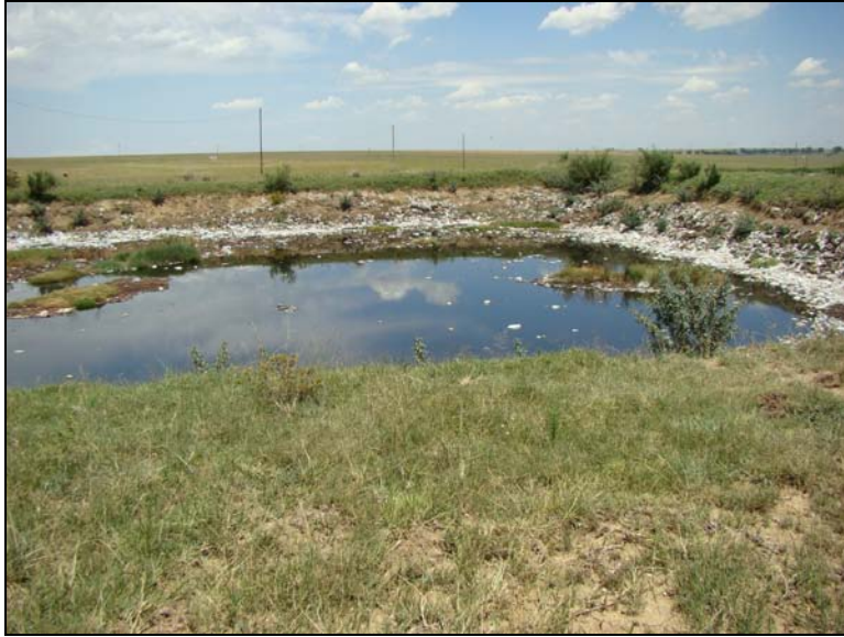
Fig.7 Old sewer in the proposed area of development.