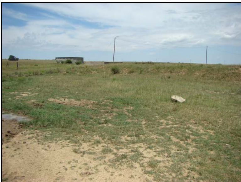
Fig.6 Old sewer in the proposed area of development.