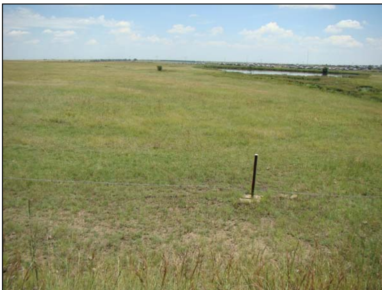
Fig.4 View from point C on the R720 main road to Senekal.