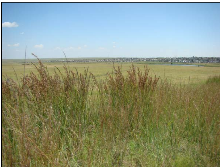
Fig.2 View across the proposed site of development at Point A.