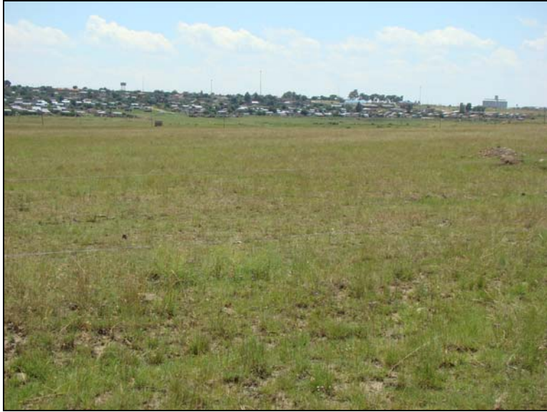
Fig.3 View from point B facing east.