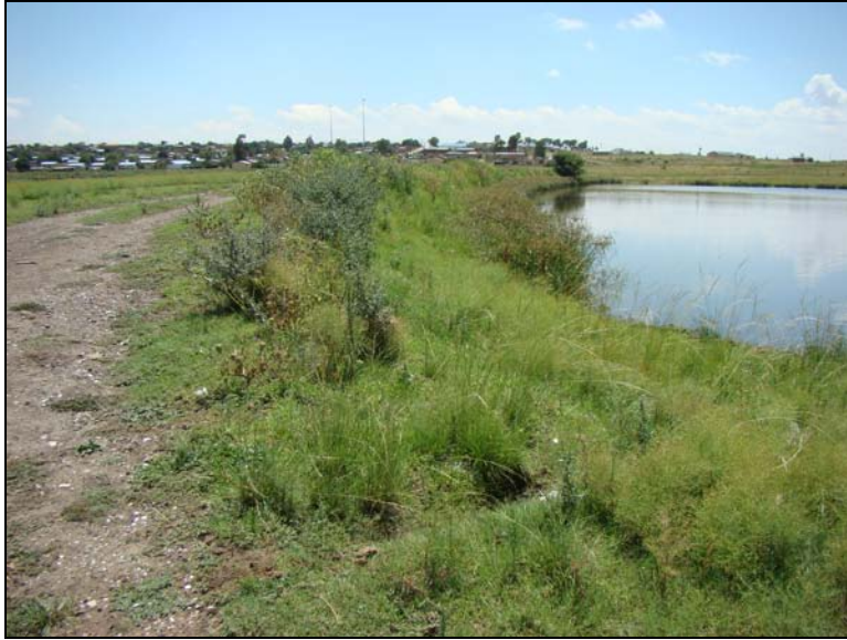
Fig.5 Dam in the proposed area of development.