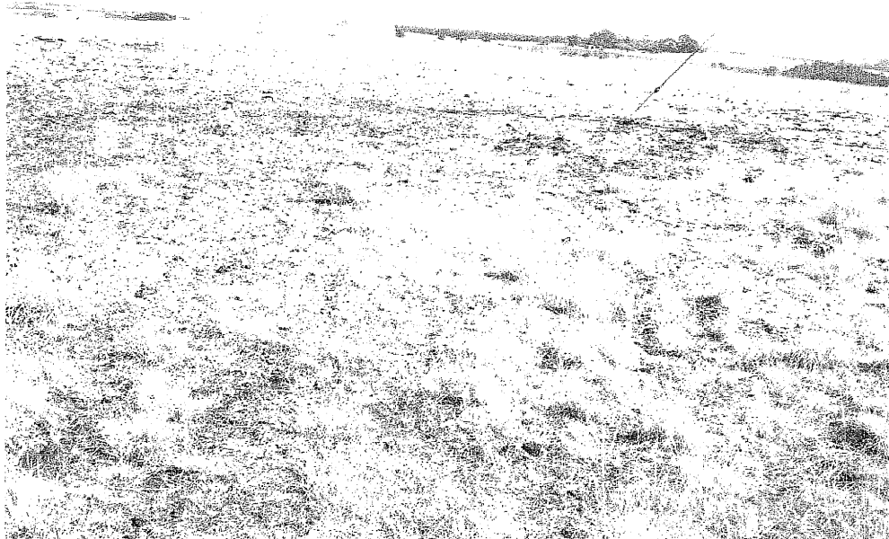
Photo 1. Proposed area for power sub station development.