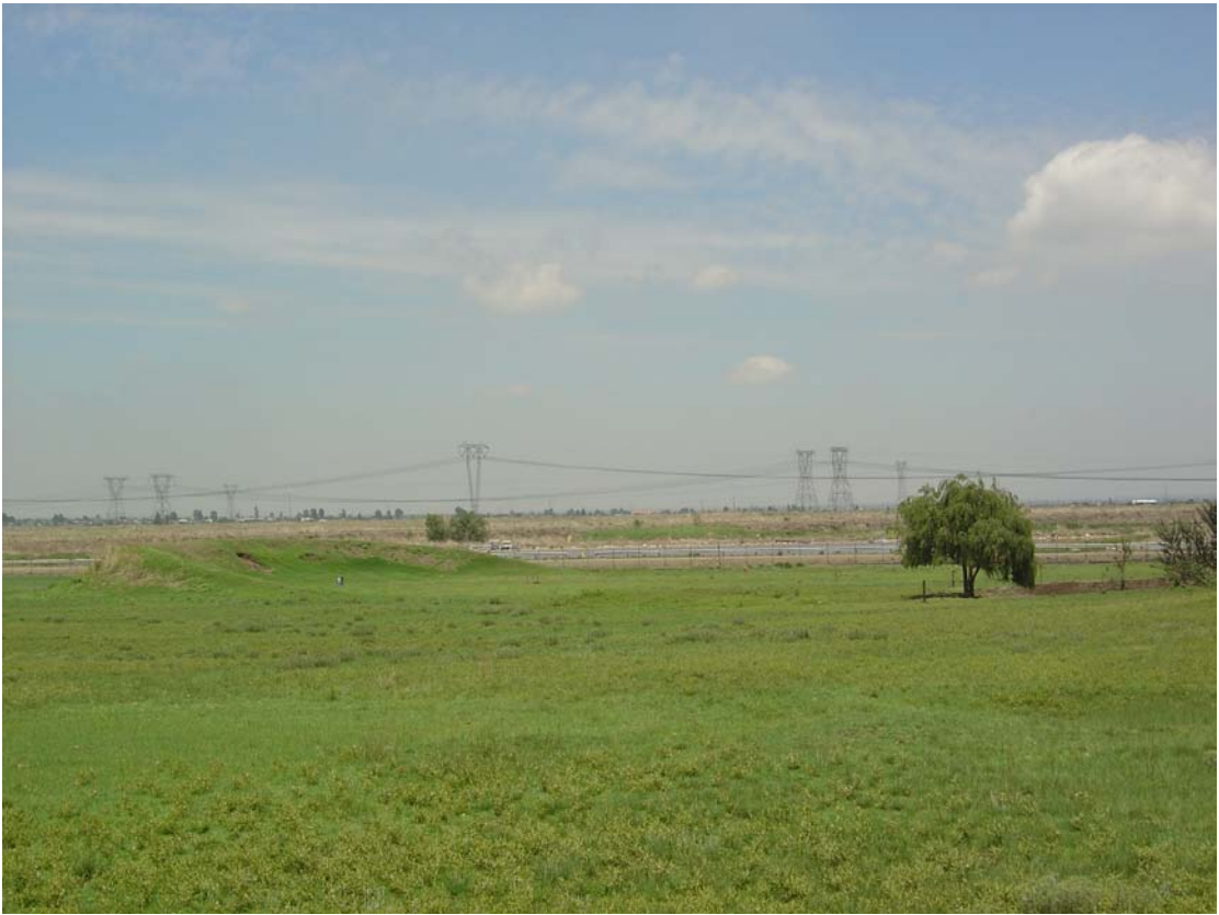
The site with the soil wall of the shooting range on the left hand side