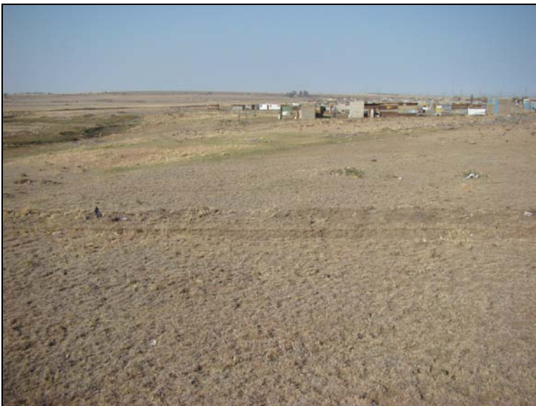
Fig.4 Point G facing south.