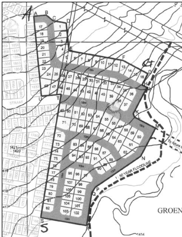
Map 2 Placing of the new residential developments at Mmamahahabane, Ventersburg. GPS points A, G and S are indicated.