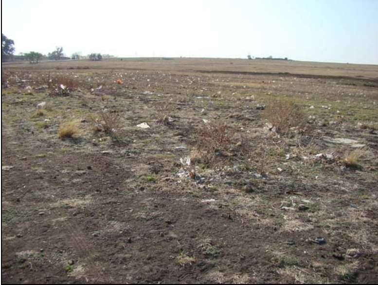
Fig.7 Point S facing east. R70 main road to Senekal on the left.