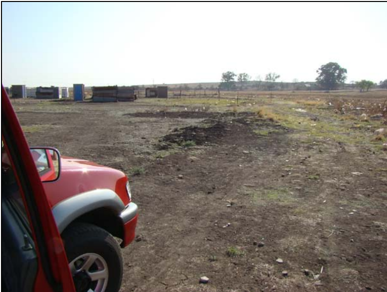
Fig.6 Point S facing north.