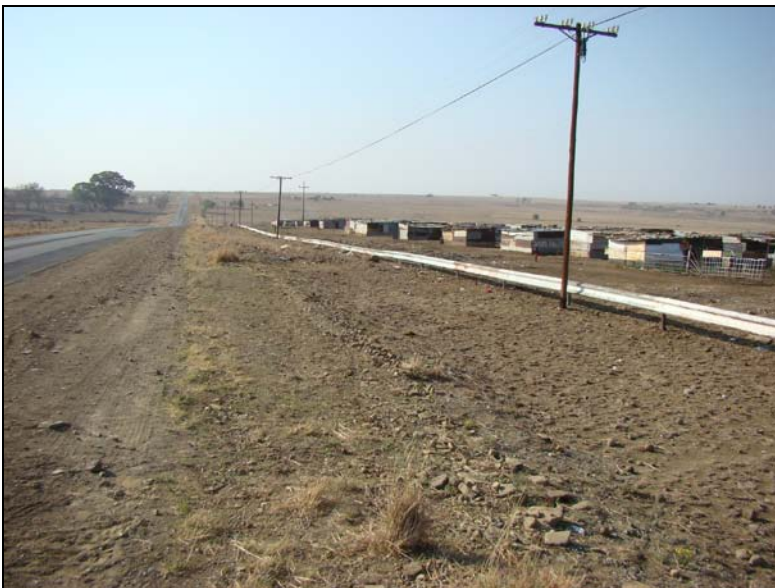
Fig.2 Point A facing east.