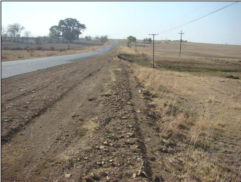
Fig.3 Point G at Mmahahabane, Ventersburg, facing east along the R70 road to Senekal.