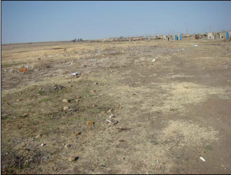
Fig.5 Point S facing south.