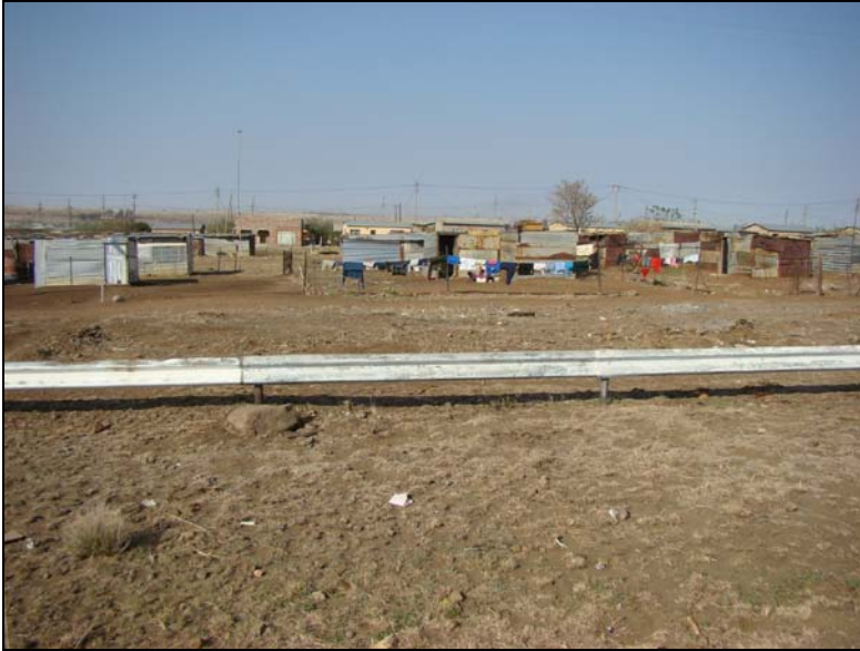
Fig.1 View from point A of the existing informal settlement at Mmamahahabane, Ventersburg, facing south.