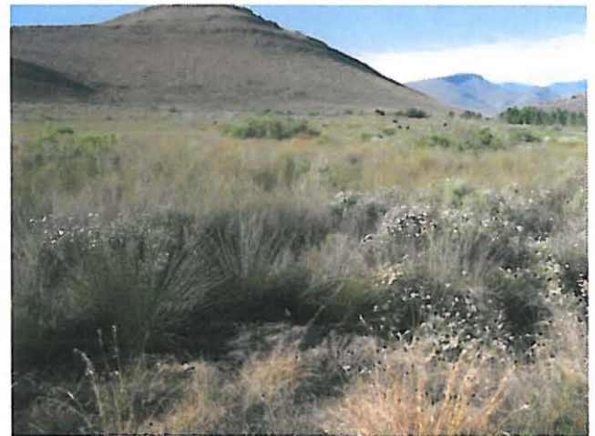
Figure 6. View of the site facing south east