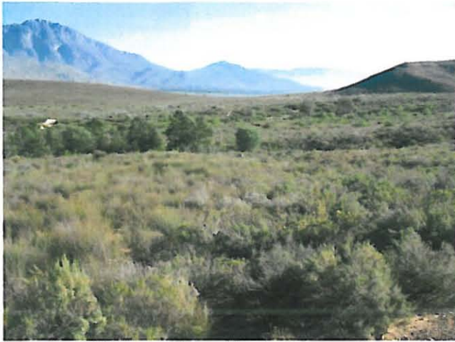
Figure 3. View of the site facing north west