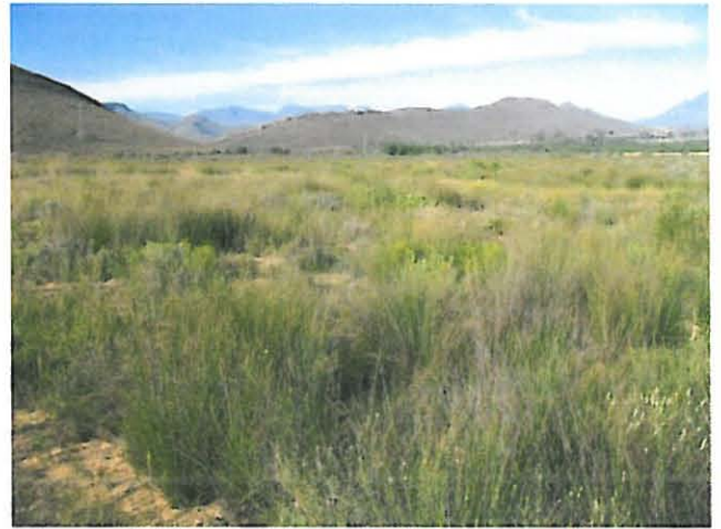
Figure 5. View of the site facing south