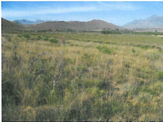
Figure 4. View of the site facing south west