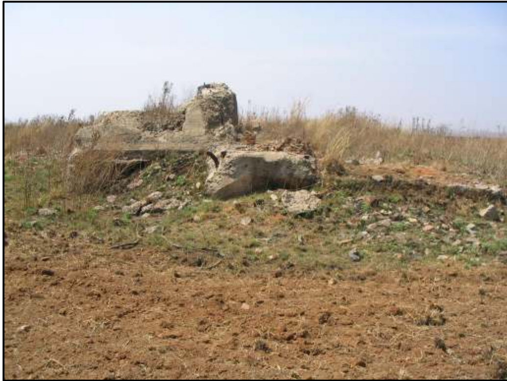
Figure 2: Surface remains of ventilation shaft