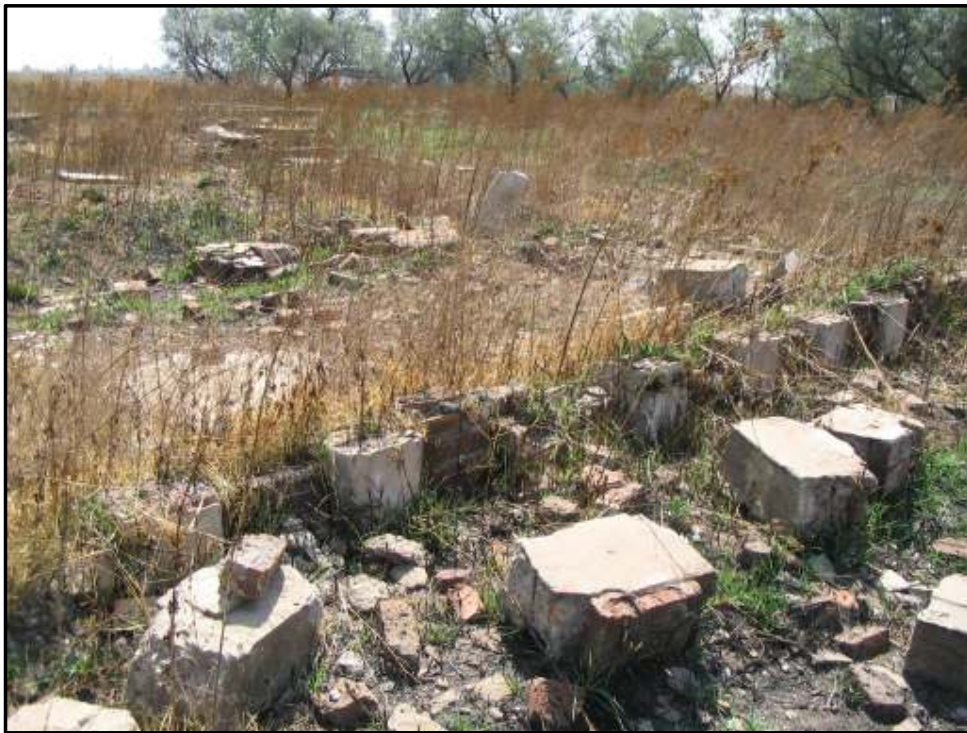
Figure 3: Foundations of demolished buildings