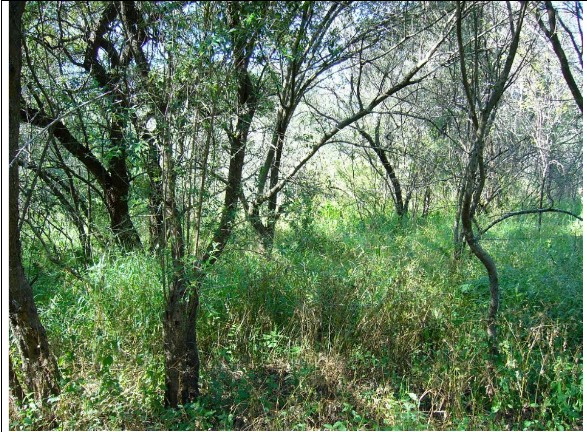
Fig 1. View of development area