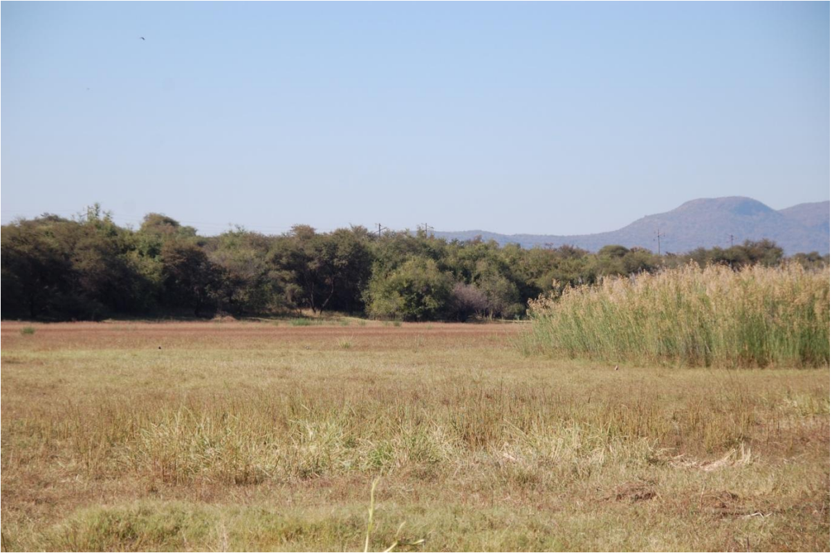
Photo 1. Marshland within the study area