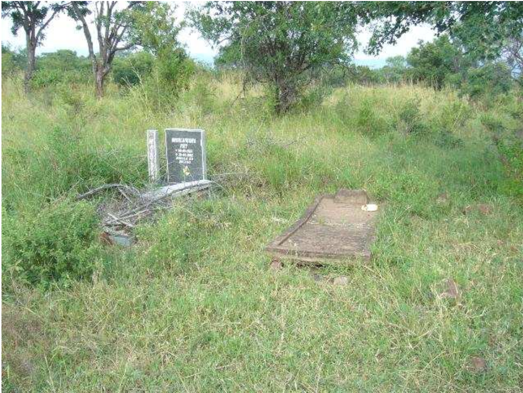
Fig 2. Graveyard 2.