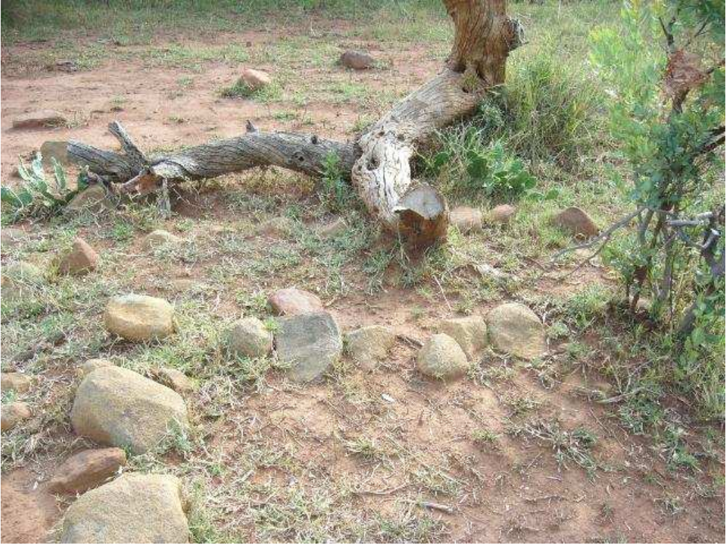
Fig 3. Graveyard 3.