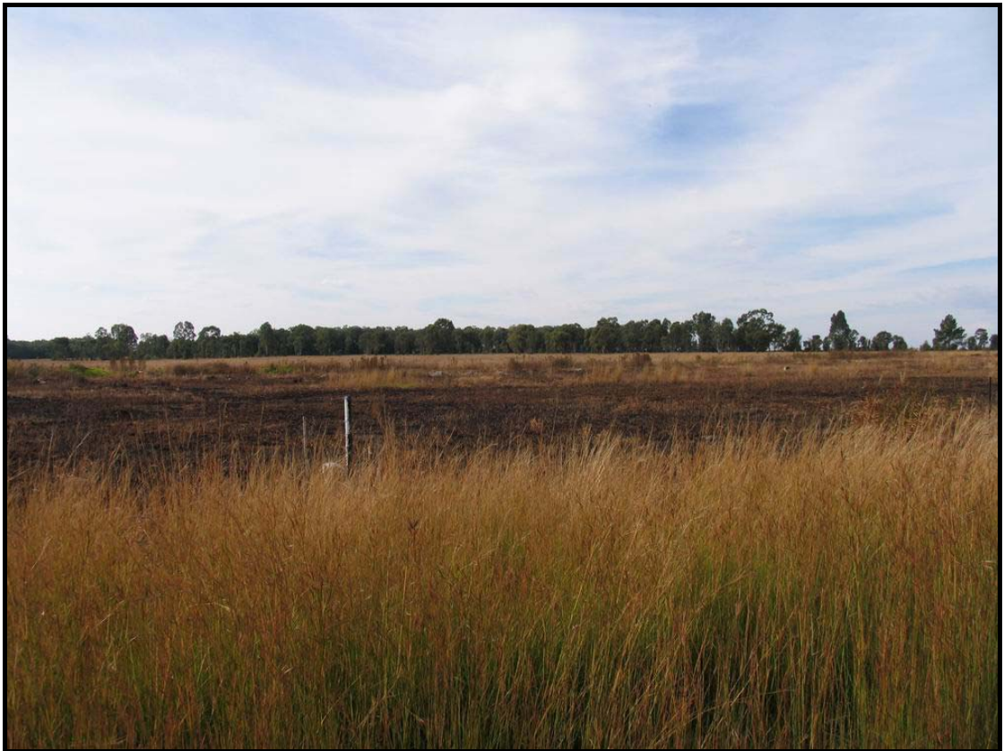
Fig. 2. View of the study area looking north.