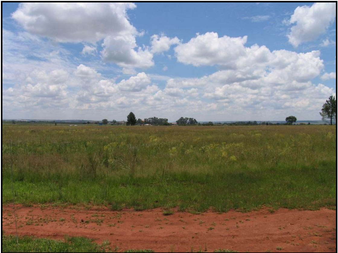
Fig. 2. View of the study area looking south towards Bronkhorstspuit.