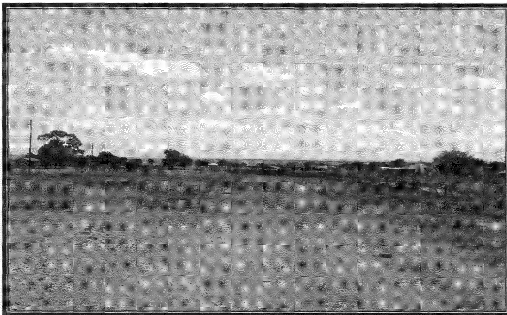
Plate 2: Proposed road would pass through currently developed sections of land flanked by built up village settlement.