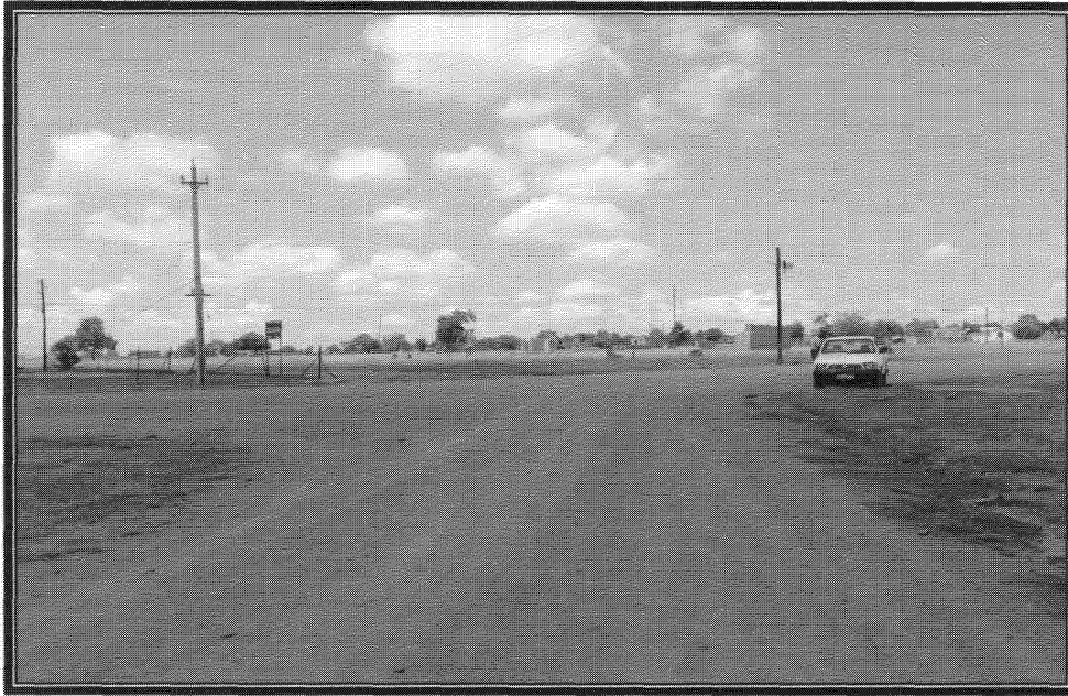
Plate 1: Proposed road upgrade route comes to Matlala Village to this crossroad area in middle of the village.