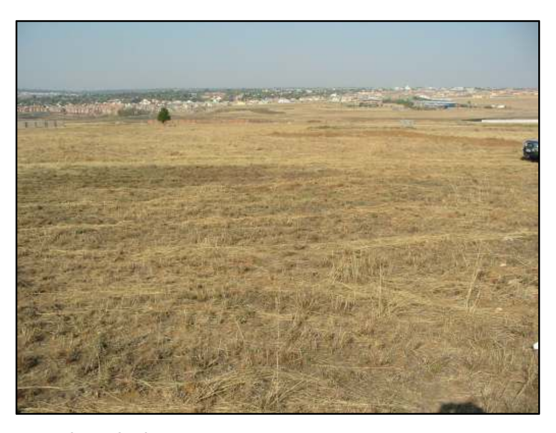
Figure 1: General Site Conditions

No heritage significant sites could be located within the study area. Since the grass is cut within the study area, ground visibility is medium. The proposed school is located on portion 97 of the farm Witpoort no. 551 at Coordinates S 25°57'10.46031" E 28°06'02.37447".