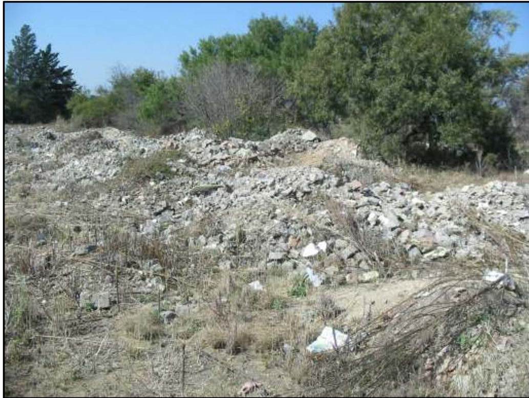
Figure 1: General Site Conditions

No heritage significant sites could be located within the study area. Ground visibility is low – medium due to the illegal dumping of building rubble in the study area. The proposed school is located on holding no. 103 at Coordinates S 26°02'39.94170" E 27°58'04.10198" .