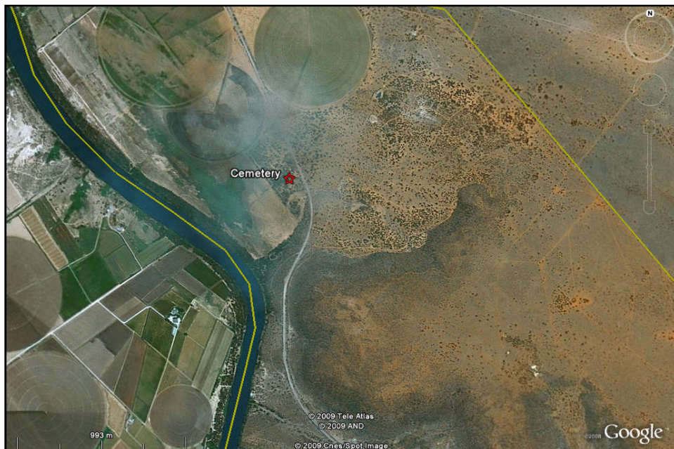
Figure 3: Close-up of the existing cemetery on Olie Rivier 170