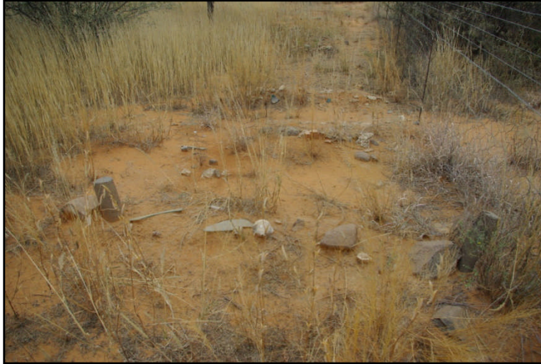
Figure 15: Graves located adjacent to the existing property fence - 1