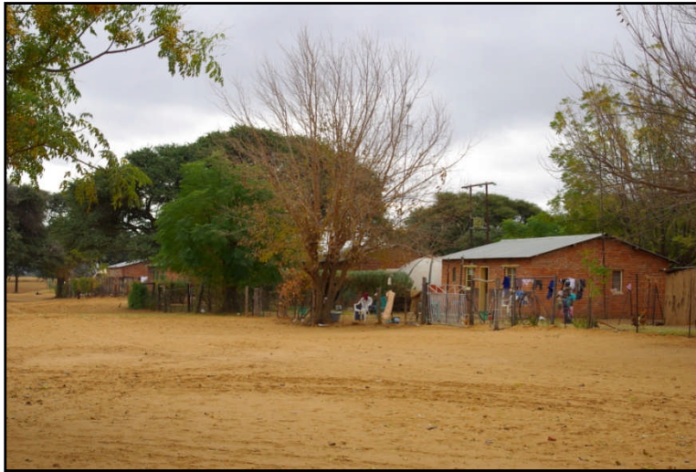
Figure 7: View of some residences from the workers village