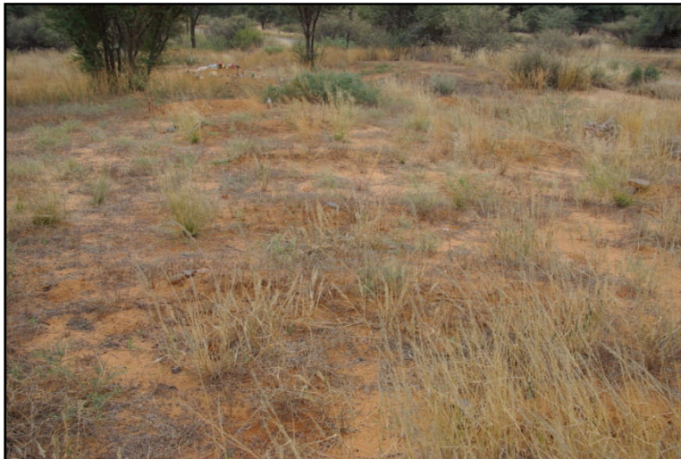
Figure 10: General view of some graves located in the central portion of the cemetery