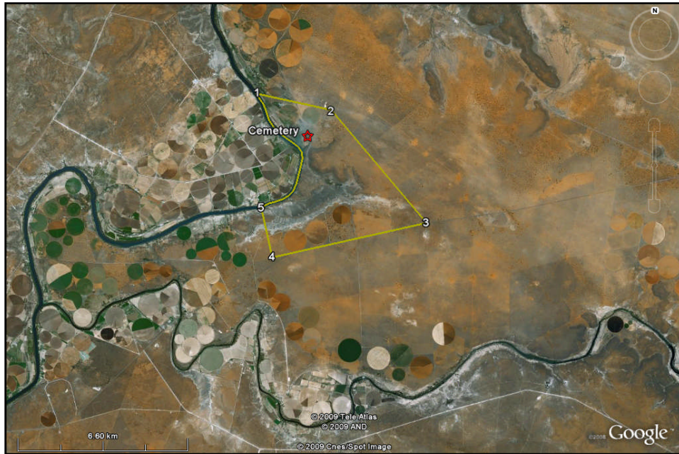
Figure 2: Locality of the existing cemetery on Olie Rivier 170

The proposed Cemetery Development impact at the study site (remainder of the study site not impacted on as yet and excluding Historic Period graves protected under the NHRA 1999) is expected to be total ; resulting in the loss of all surface and sub-surface heritage resources that may be present at the development area.