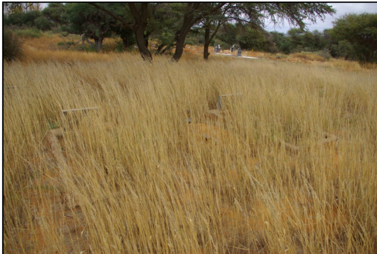
Figure 13: View of well demarcated graves located in the southern portion of the existing cemetery