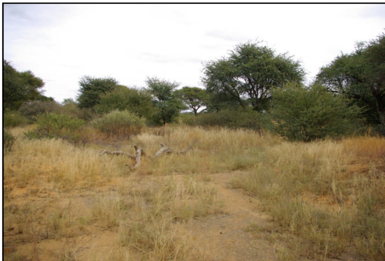
Figure 8: General view of the proposed development area