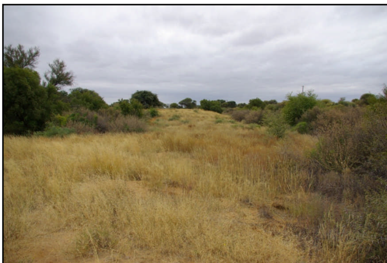
Figure 17: General view of the area west of the existing cemetery