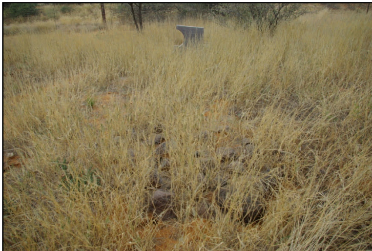
Figure 11: View of some graves located in the southern portion of the cemetery