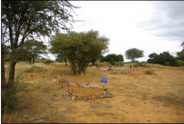
Figure 9: General view of the cemetery, with northern contemporary graves in the foreground and western contemporary graves characterizing the background