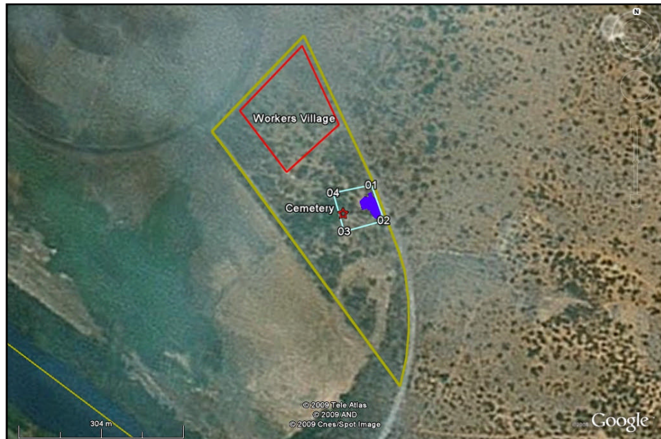
Figure 5: Phase 1 AIA assessment findings

More recent graves are located towards the western (W) and north eastern (NE) extremity of the demarcated existing cemetery area.