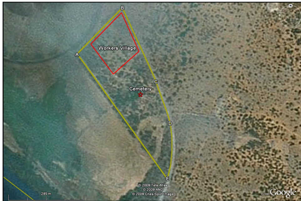
Figure 4: Phase 1 AIA assessment area

An access road runs roughly along line B-A-E, serving primarily the spill-point and agricultural fields. The development will not necessitate an access road to the cemetery. However, an access road line route for development purposes is accommodated in the general surveyed area.