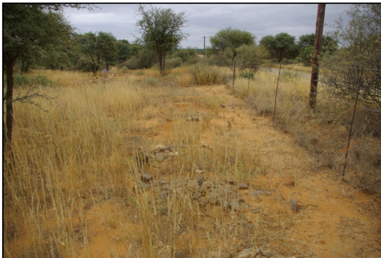
Figure 16: Graves located adjacent to the existing property fence - 2