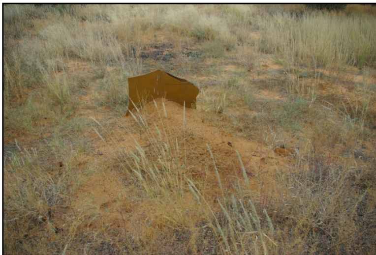
Figure 14: View of the southern most located grave