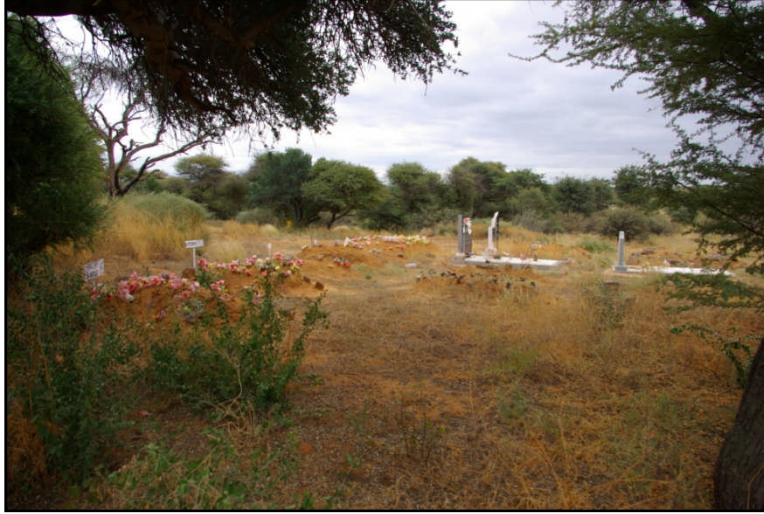
Figure 12: General view of the western contemporary portion of the existing cemetery