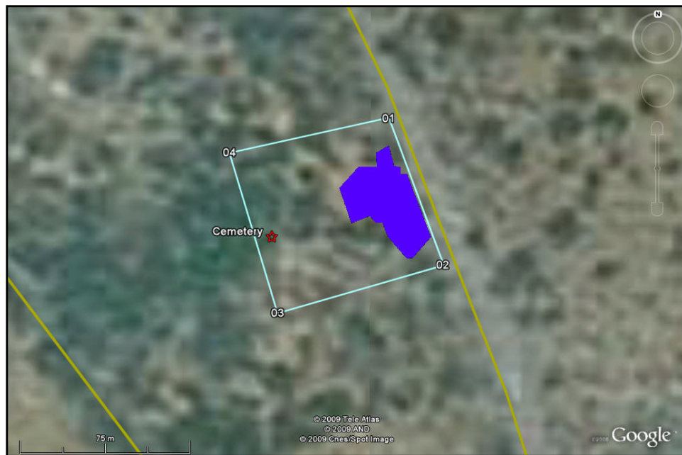
Figure 6: Close-up of the cemetery area