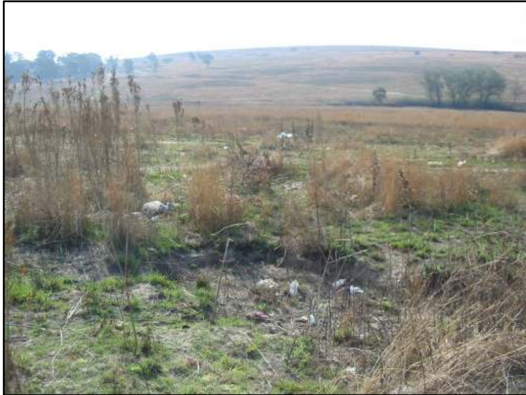
Figure 1: General Site Conditions

No heritage significant sites could be located within the study area. Ground visibility is medium due to grass cover and refuse dumping. Local resident Simon Dtitzi indicated no know graves are present with in the study area. The proposed school is located in close proximity to the intersection of Kingfisher and Francolin Street at Coordinates S 25°54'45.75529" E 28°06'40.48119" .