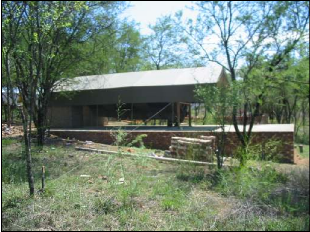
Figure 2: Existing tent