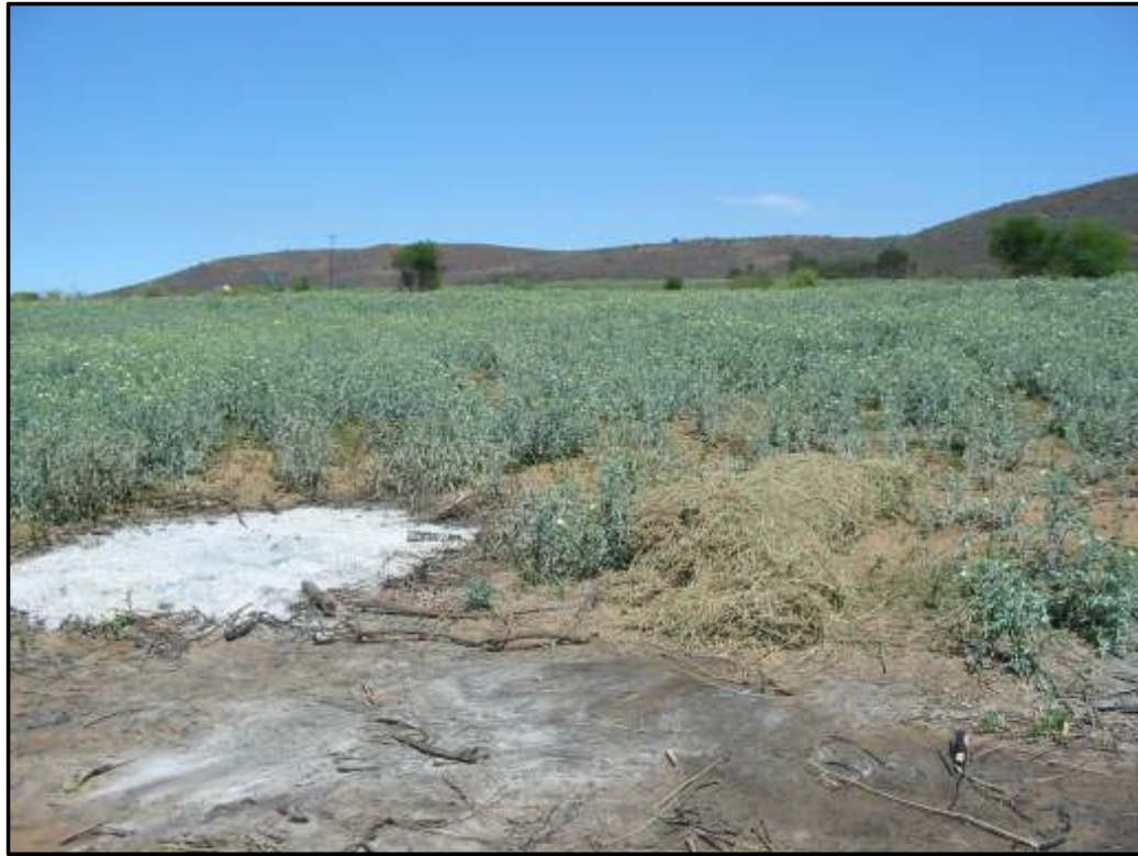
Figure 1: General Site conditions

No heritage significant sites are located within the study area. The study area is extensively disturbed by old agricultural fields. However these ground moving activities did not expose any archaeological material