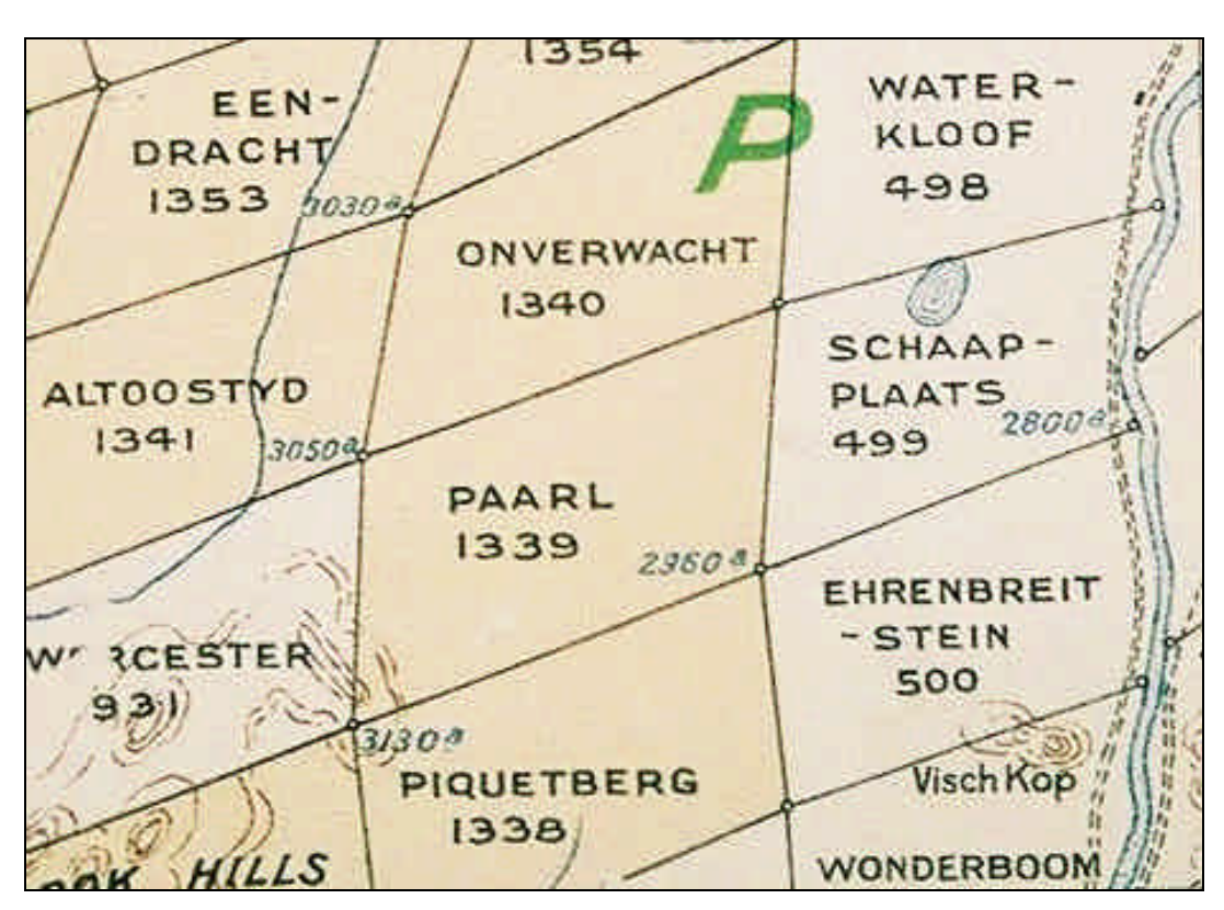
Figure 1 "Palala Mouth" sheet of the Transvaal and Orange River Map Series. The map was drawn on the 1<sup>st</sup> of April 1911.

No heritage features are shown on the farm Onverwacht. The light brown colour shading indicates that at the time it was un-proclaimed government ground. The present-day town of Ellisras is not shown on the map, and would later be established where one building is shown on the farm Waterkloof.