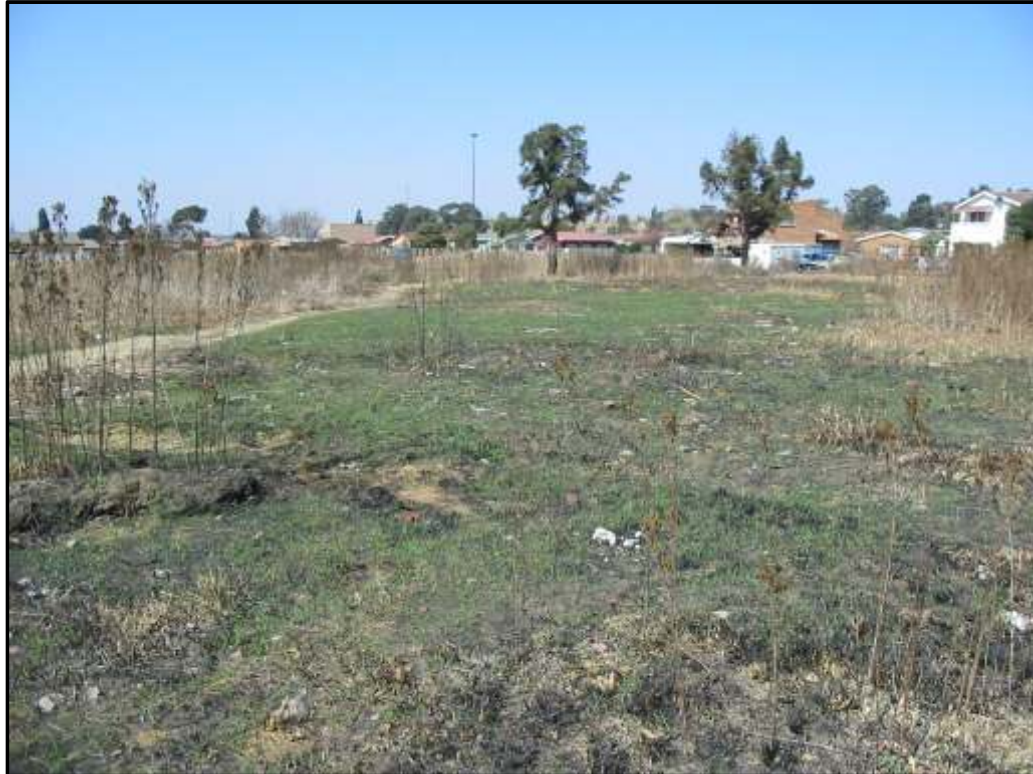
Figure 1: General Site Conditions

No heritage significant sites are located within the study area. Ground visibility is medium due to irregular dumping of refuse and building rubble in the study area. The proposed school is located at the intersection of Manvell Felix Street and Goede Hoop Avenue, Raiger Park Township Extension 1. Coordinates S 26° 13' 53.10945" E 28° 13' 22.00129" .