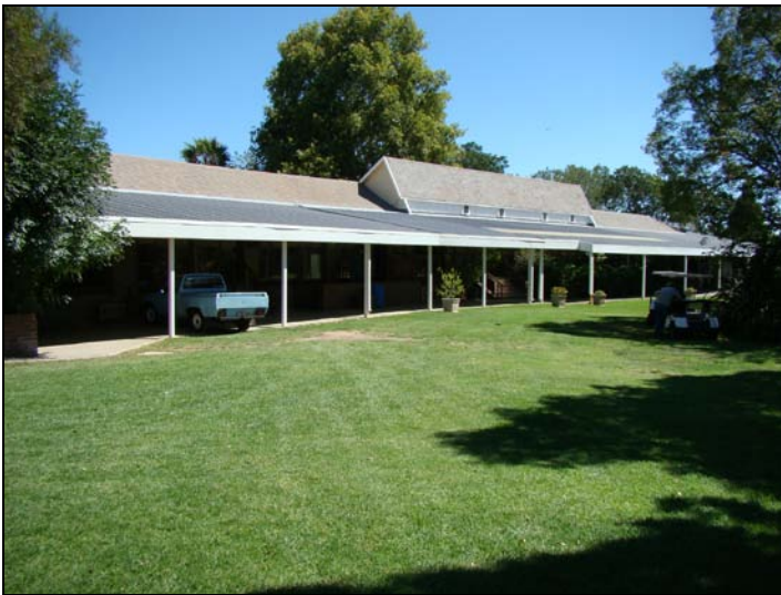
Fig.1 Club house at the Welkom Golf Course.