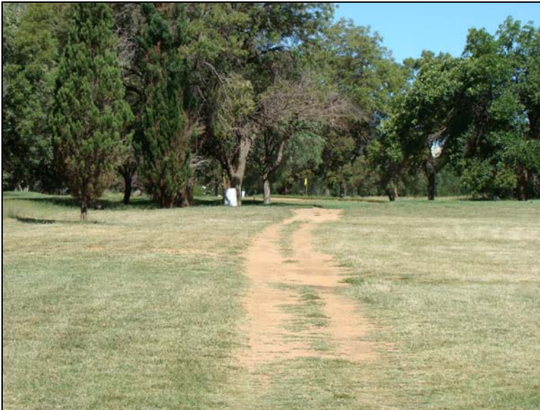
Fig.8 Hole 13.