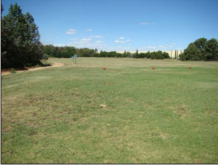
Fig.2 View from the club house at the Welkom Golf Course.