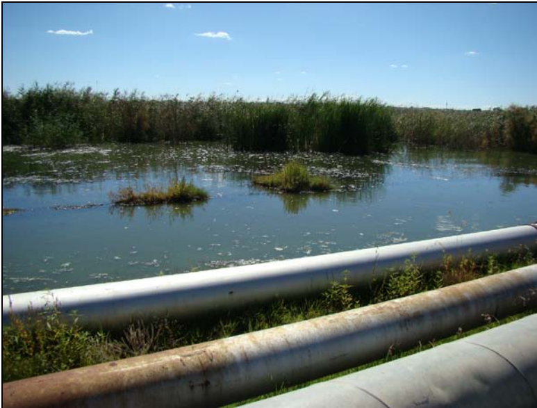
Fig.5 Hole 5.