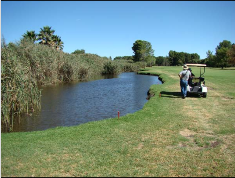
Fig.12 Hole 14.