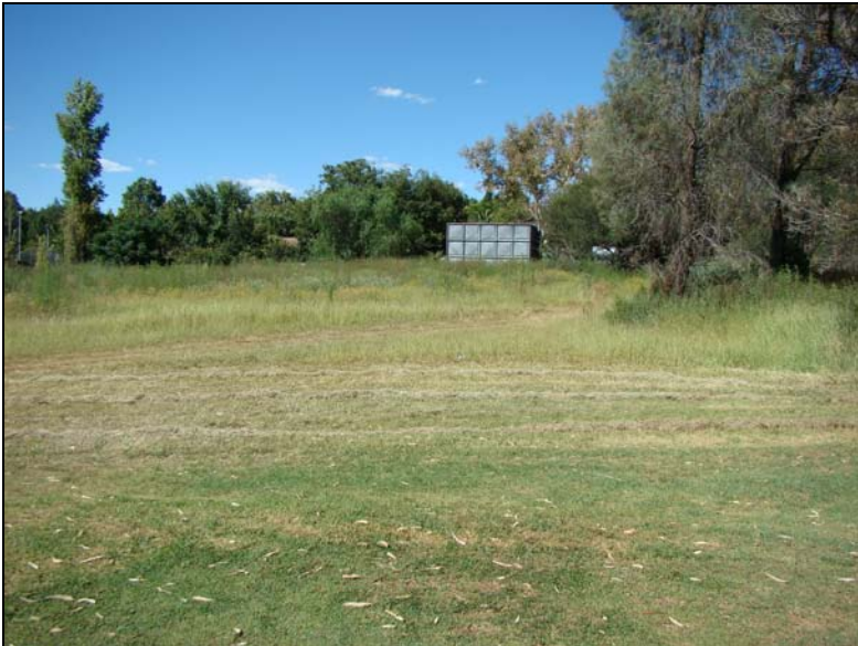
Fig.7 Hole 11.