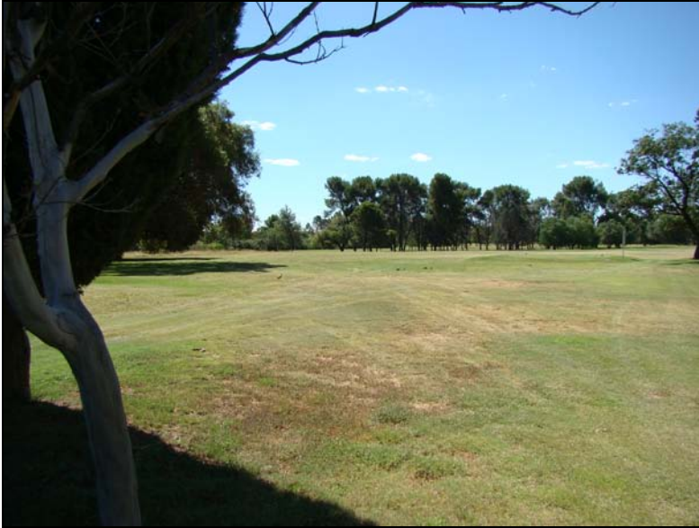
Fig.10 Hole 14.