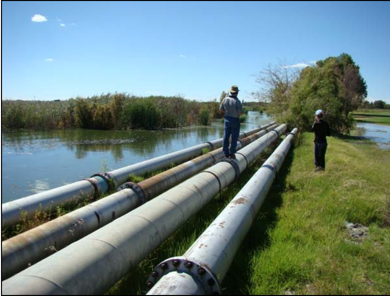
Fig.4 Hole 5.