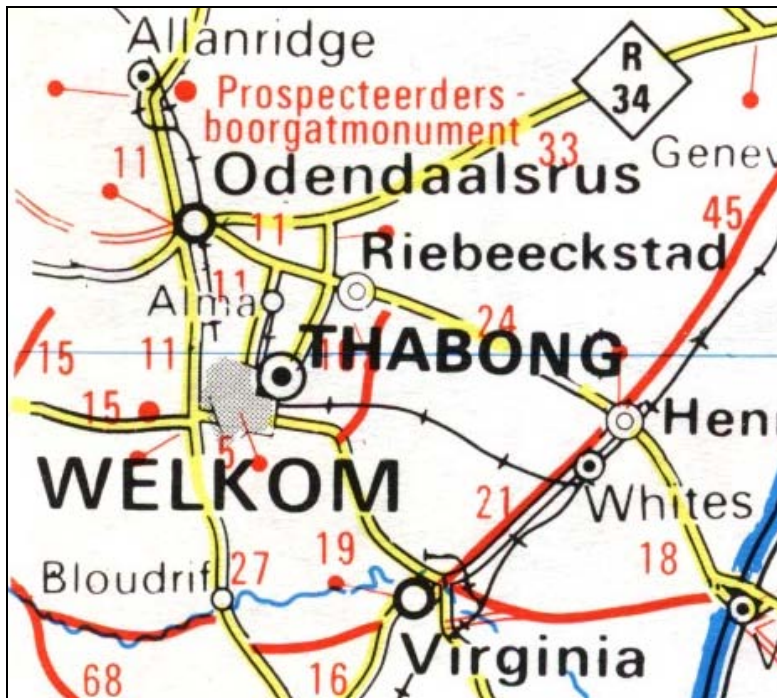
Map 1 Locality of Virginia in relation to Welkom, Odendaalsrus and Allanridge.