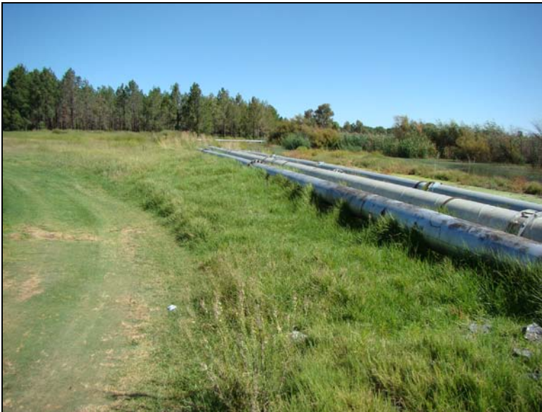
Fig.3 Hole 5 is located in a marshy area.