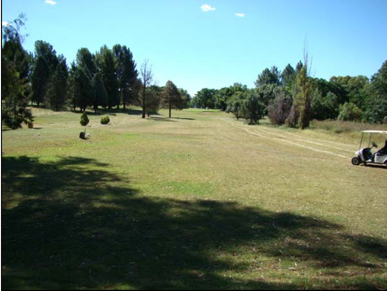
Fig.6 Hole 11.