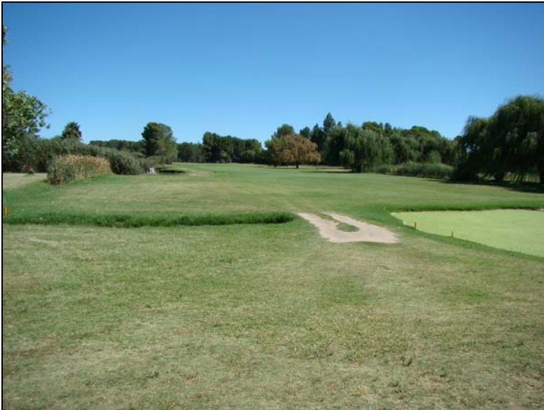
Fig.11 Hole 14