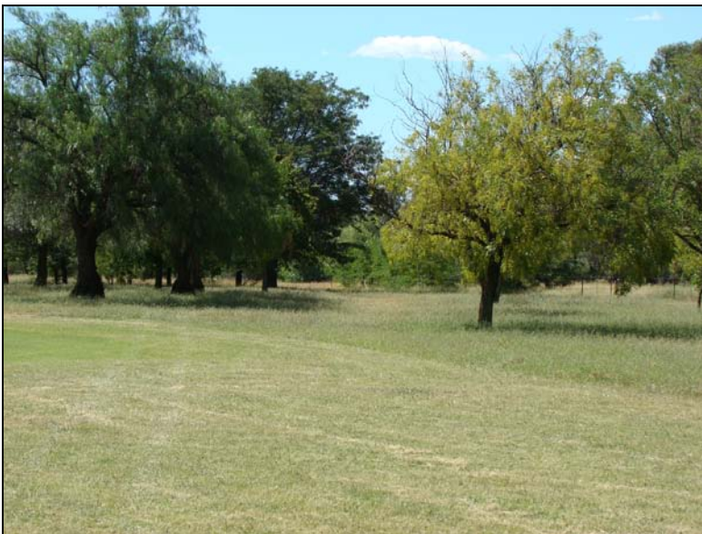
Fig.9 Hole 13.