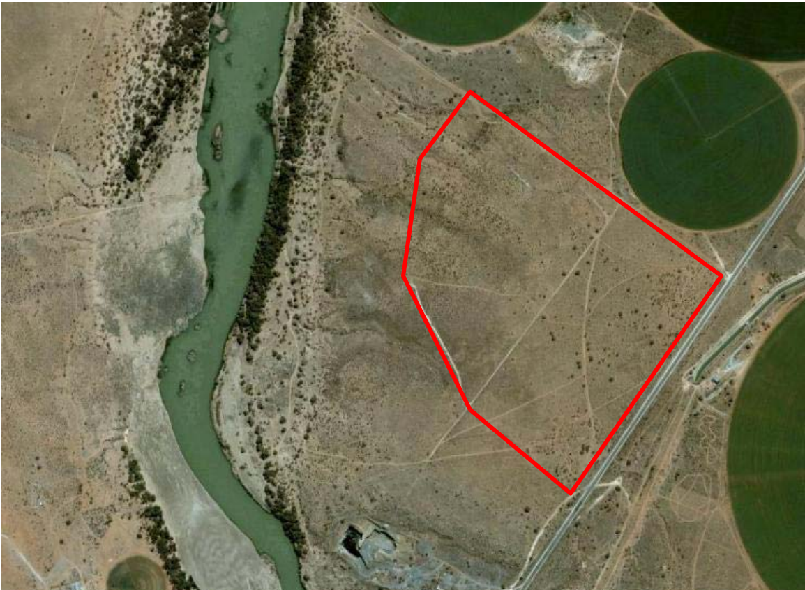
Google Earth image showing the area examined for the proposed power station development (outlined in red). The location is situated on 1:50 000 sheet 2923BA.

Varying densities of stone tools were encountered over most of the site, with none amounting to a distinctive entity or site in the archaeological sense. In some instances densities reach 2-3 artefacts per 1 x 1 m. Dolerite outcrops occur at the lower part of the proposed power station site, some of which present suitable surfaces for engravings. Although no engraving as such was found, one rock, at 29°09'06.2" S 23°42'03.3" E, bears artificially pecked markings.