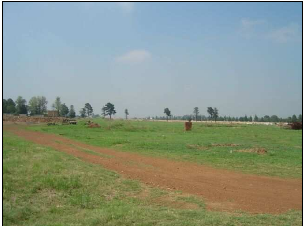
Figure 1 – Site conditions on site

Maps of 1948 indicate no structure in the area and thus none of the current structures to be older than 60 years.