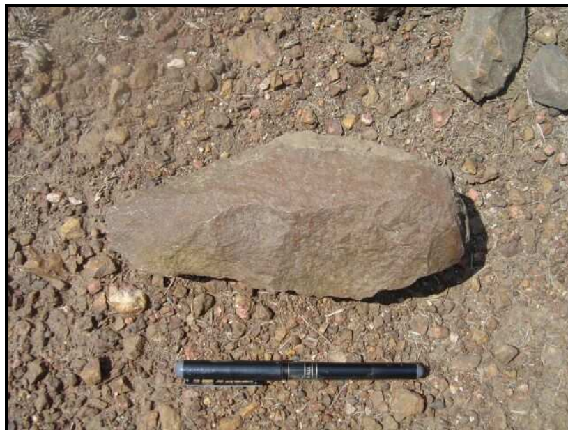
Figure 3 – Hand Axe