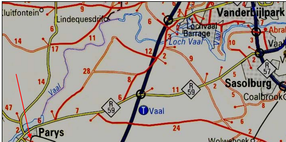
Map 1 Locality of Parys in relation to other towns in the Vaal Triangle.