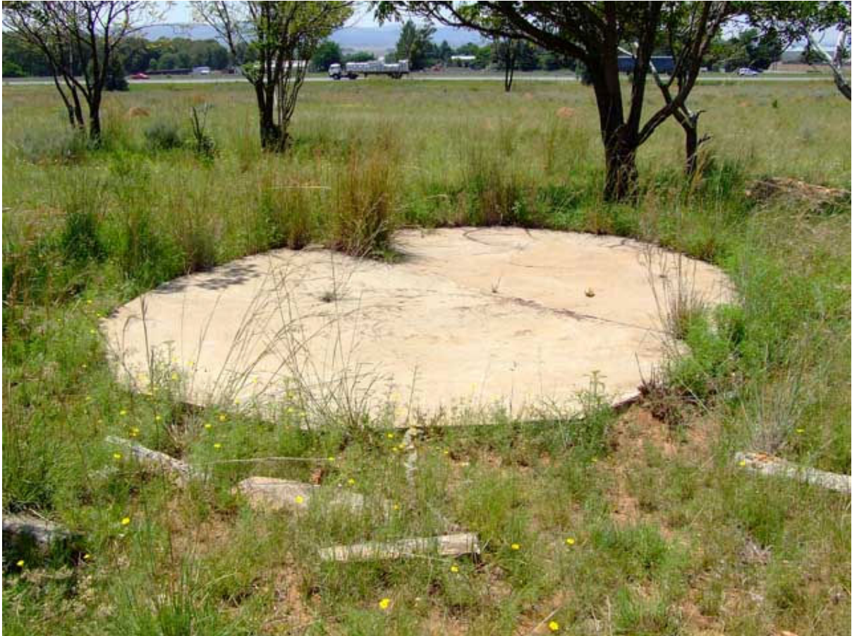
Figure 2: Foundation of previous structure.