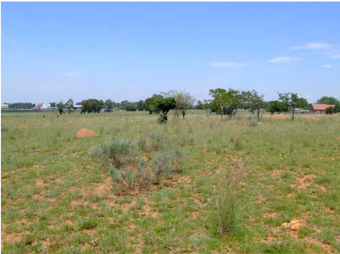
Figure 1: General view of site

(Refer to Figure 1 for general view of property.)