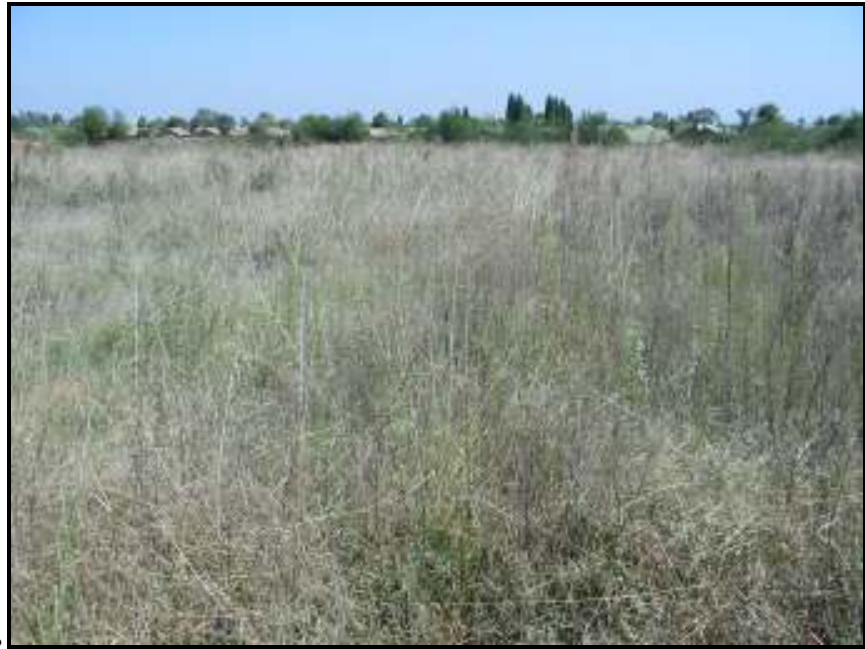
• Figure 4: General site conditions