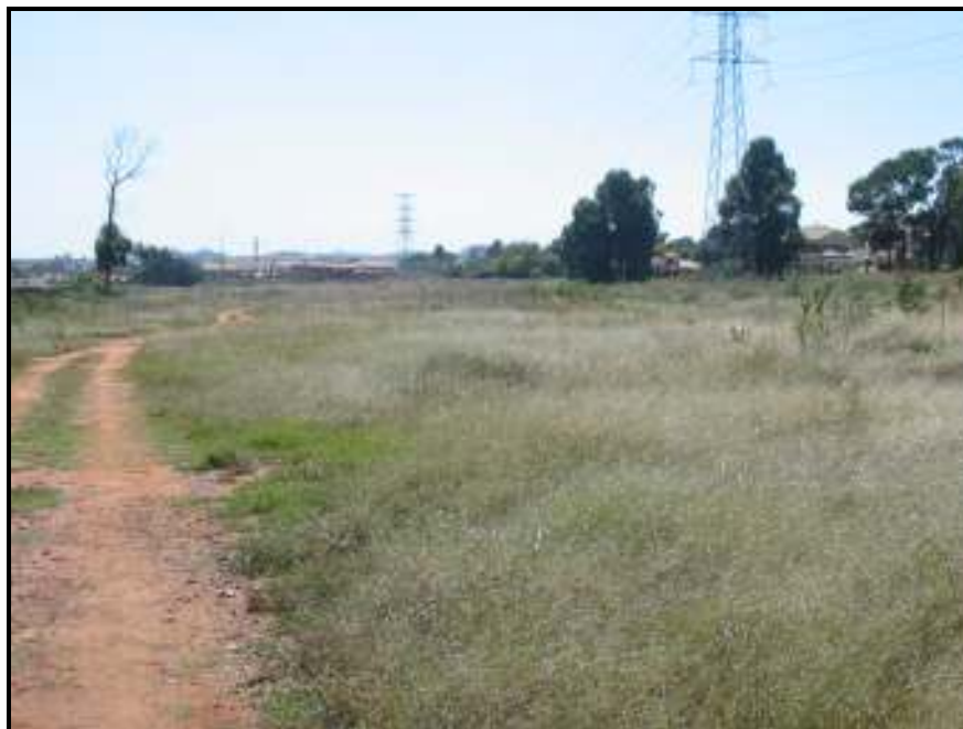
• Figure 3: General site conditions

Entrance to the site is from Beves Street in Pierre van Ryneveld just west of the Danie Joubert free way. The area is characterised by intensive building activities in the immediate surroundings. The site is overgrown and building rubble is found all over the site.