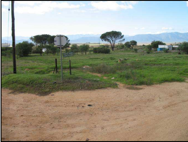
Figure 3. View of the site from Kachellhof St.