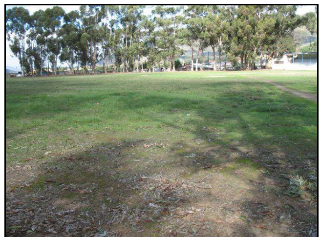
Figure 8. View of the site (showground fields) facing west