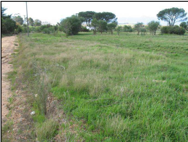
Figure 4. View of the site from Kachellhof St.