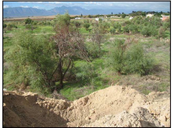
Figure 13. View of the site facing south east