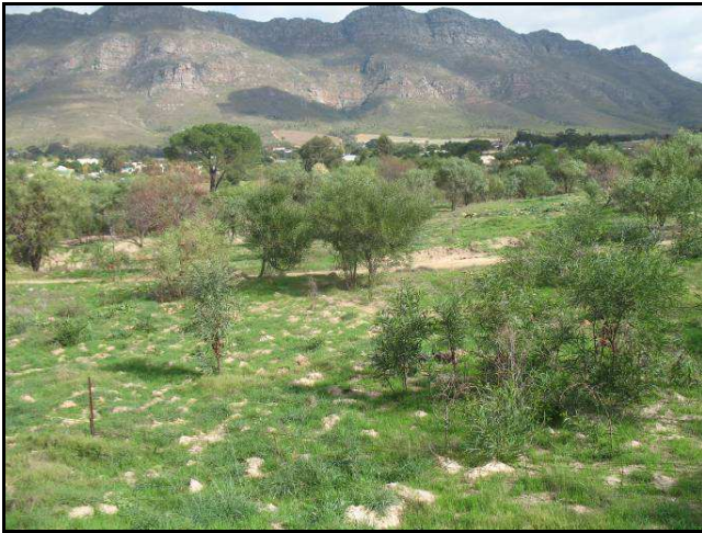
Figure 10. View of the site facing north west