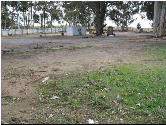
Figure 9. Showground's view facing north