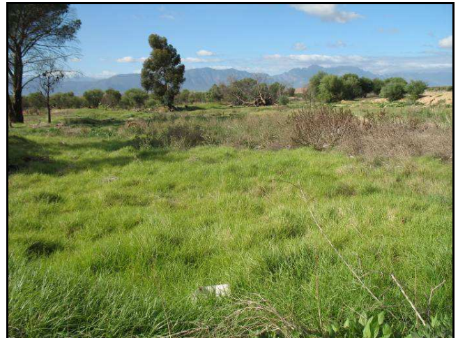
Figure 7. View of the site facing east