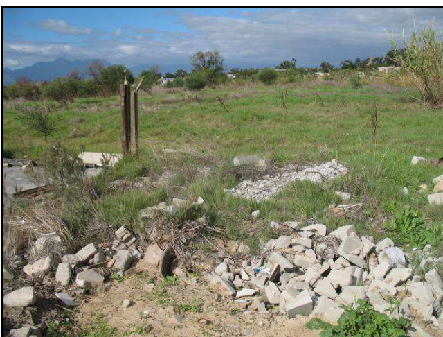
Figure 5. View of the site facing south east