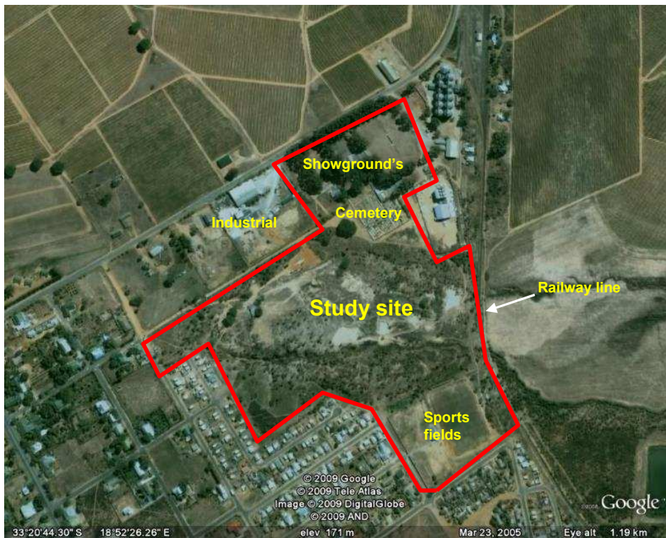
Figure 2. Aerial photograph of the study site