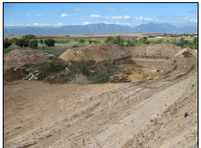
Figure 14. View of the site facing south east