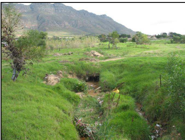
Figure 11. View of the site facing north west