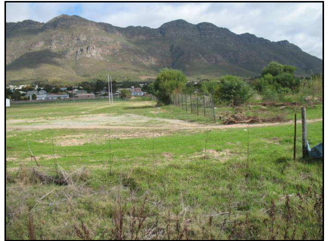
Figure 12. View of the site facing north west