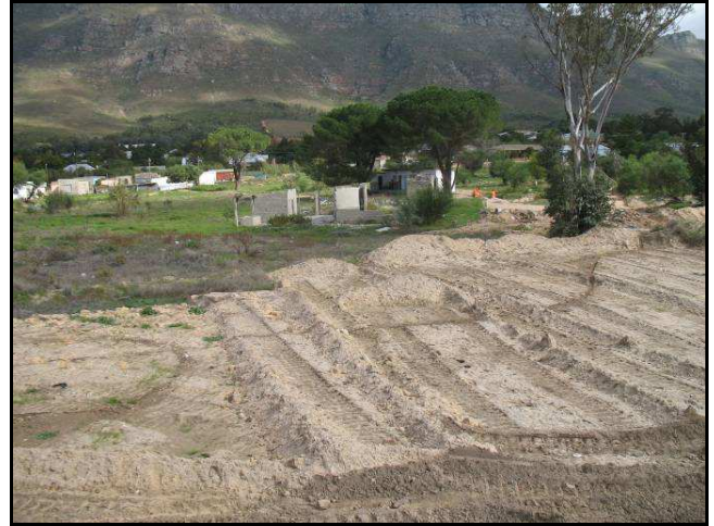
Figure 6. View of the site facing west