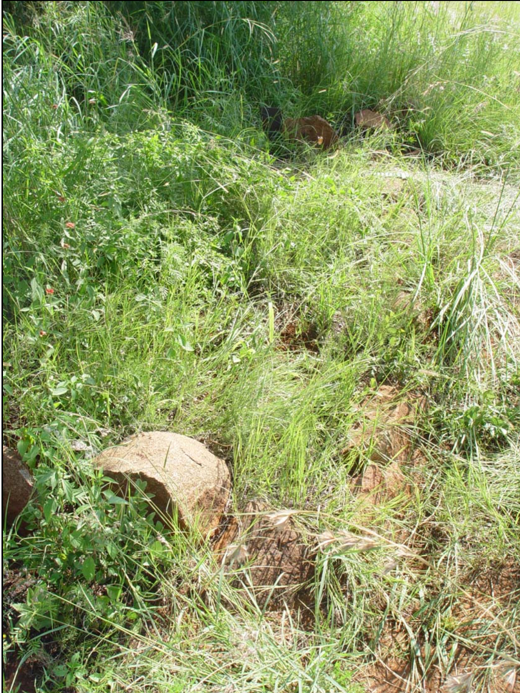
Figure 3: Another grave with headstone.