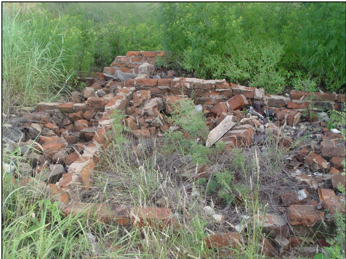
Figure 1: Foundation remains of building.