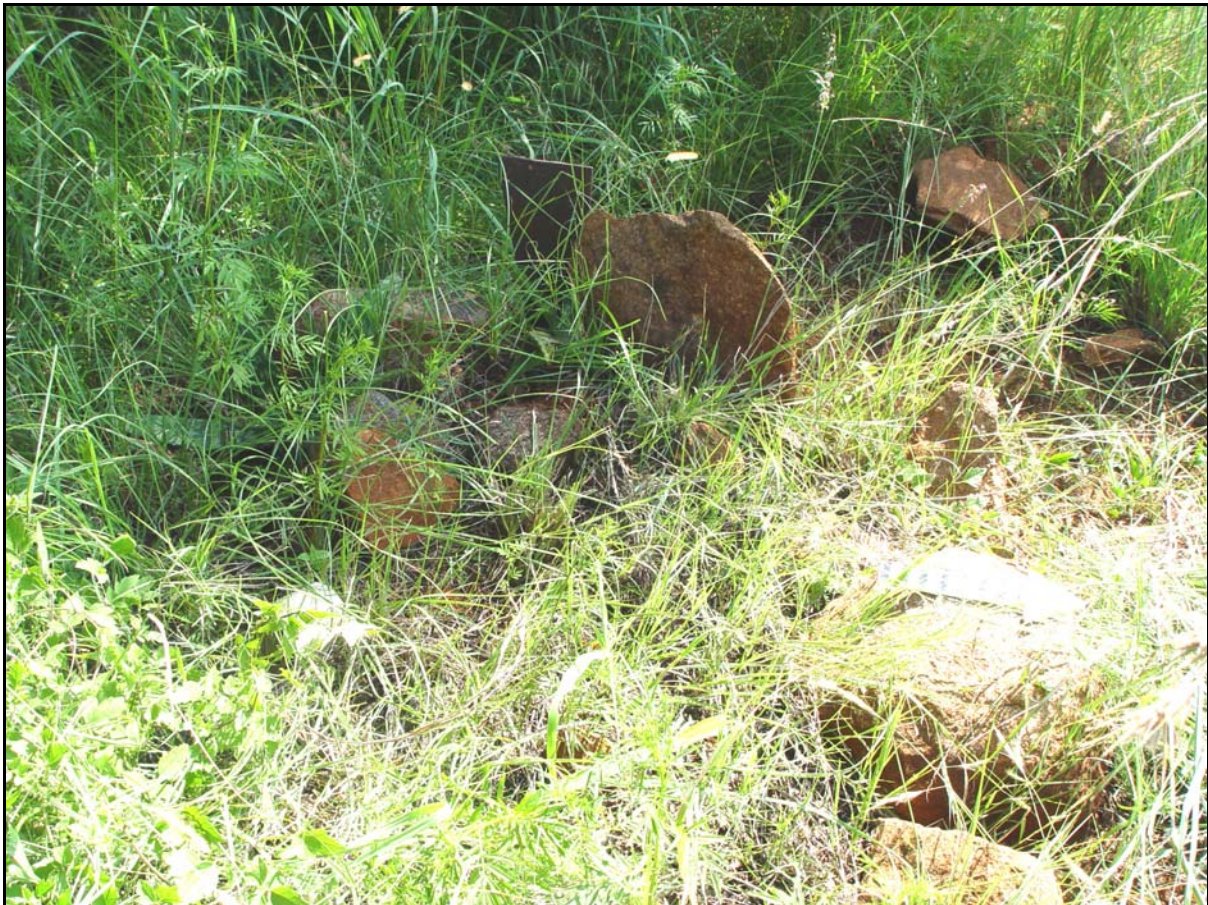
Figure 2: One of the graves with headstone.