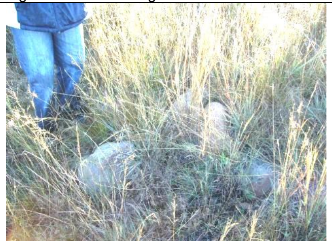
Fig 4. Site 3.