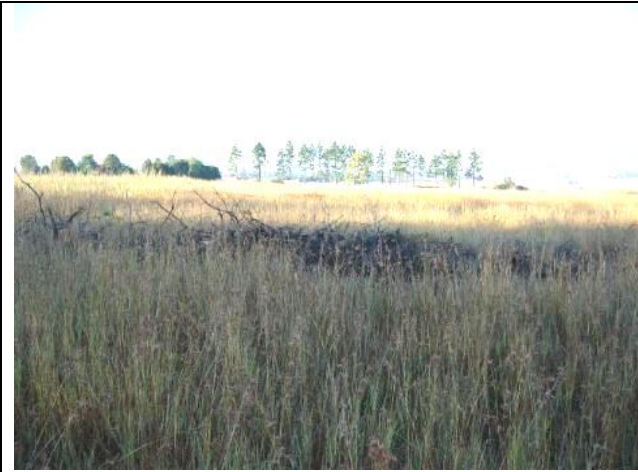
Fig 1. General view of the site.