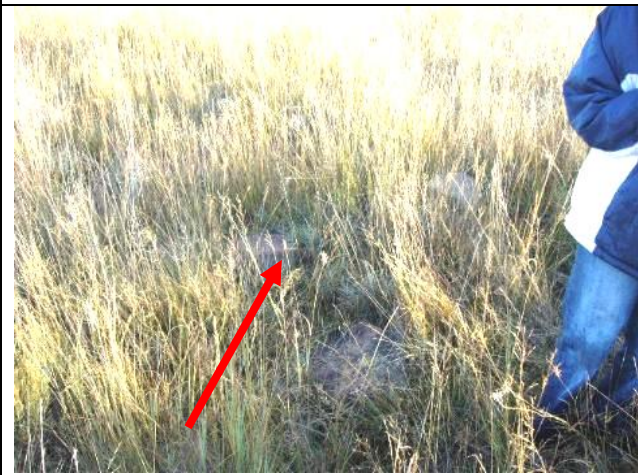
Fig 3. View of site 2, note stone.