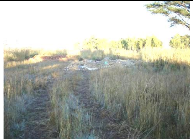
Fig 2. View of building rubble.