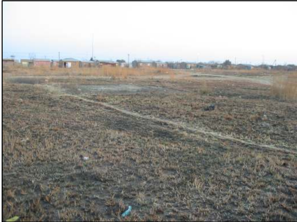
Figure 1: General Site Conditions

No heritage significant sites could be located within the study area. However houses probably older than 60 years occur outside the development footprint. The grass within the study area has been cut and therefore ground visibility is high. The proposed school is located in close proximity to the intersection of Mayibuye and Glova Street at Coordinates S 26°36'11.21871" E 27°48'42.16081" .